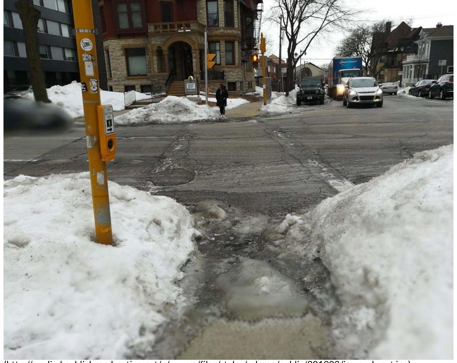
(http://mediad.publicbroadcasting.net/p/wuwm/files/styles/x_large/public/201902/icy_curb_cut.jpg) Snow and ice build up at curb cuts can prevent people with disabilities from being able to get around.