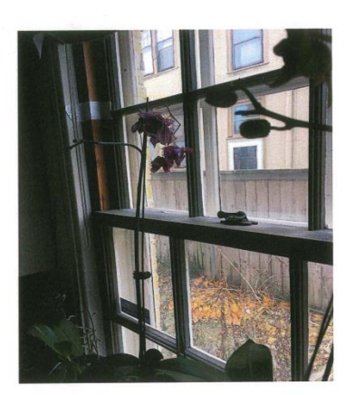
Existing Kitchen Window