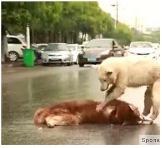
What Happened Next Shocked Animal Lovers