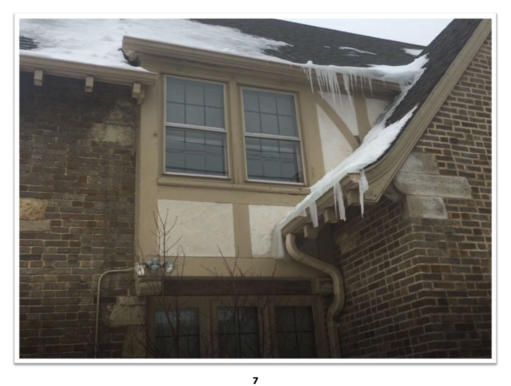
Figure 6. Some of storm/screen combinations to be replaced on east elevation.