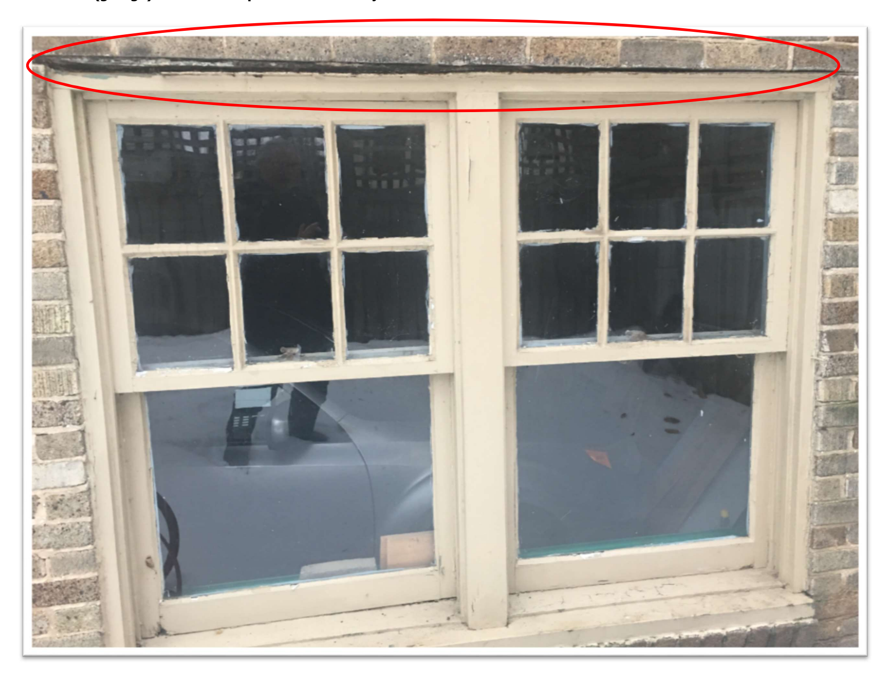
Figure 1. First floor (garage) lintel to be replaced on north façade.