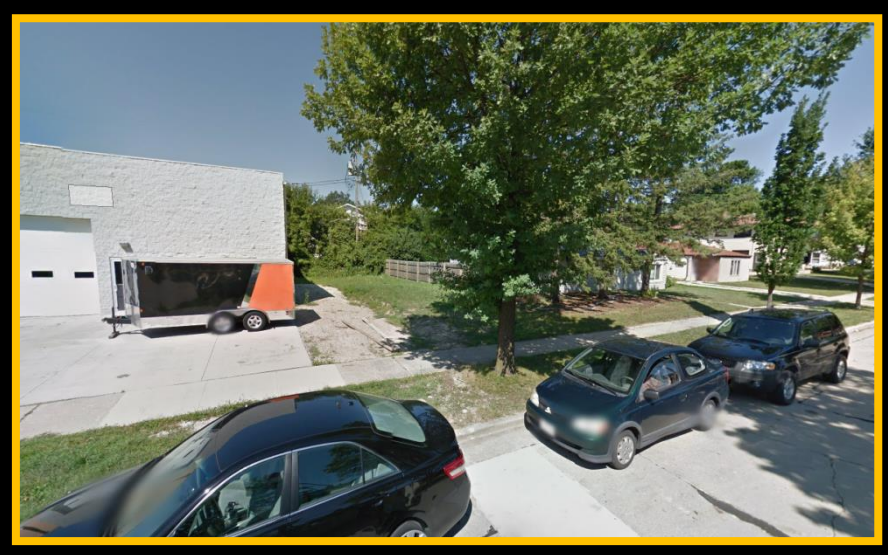
View from South 93<sup>rd</sup> Street looking north-west