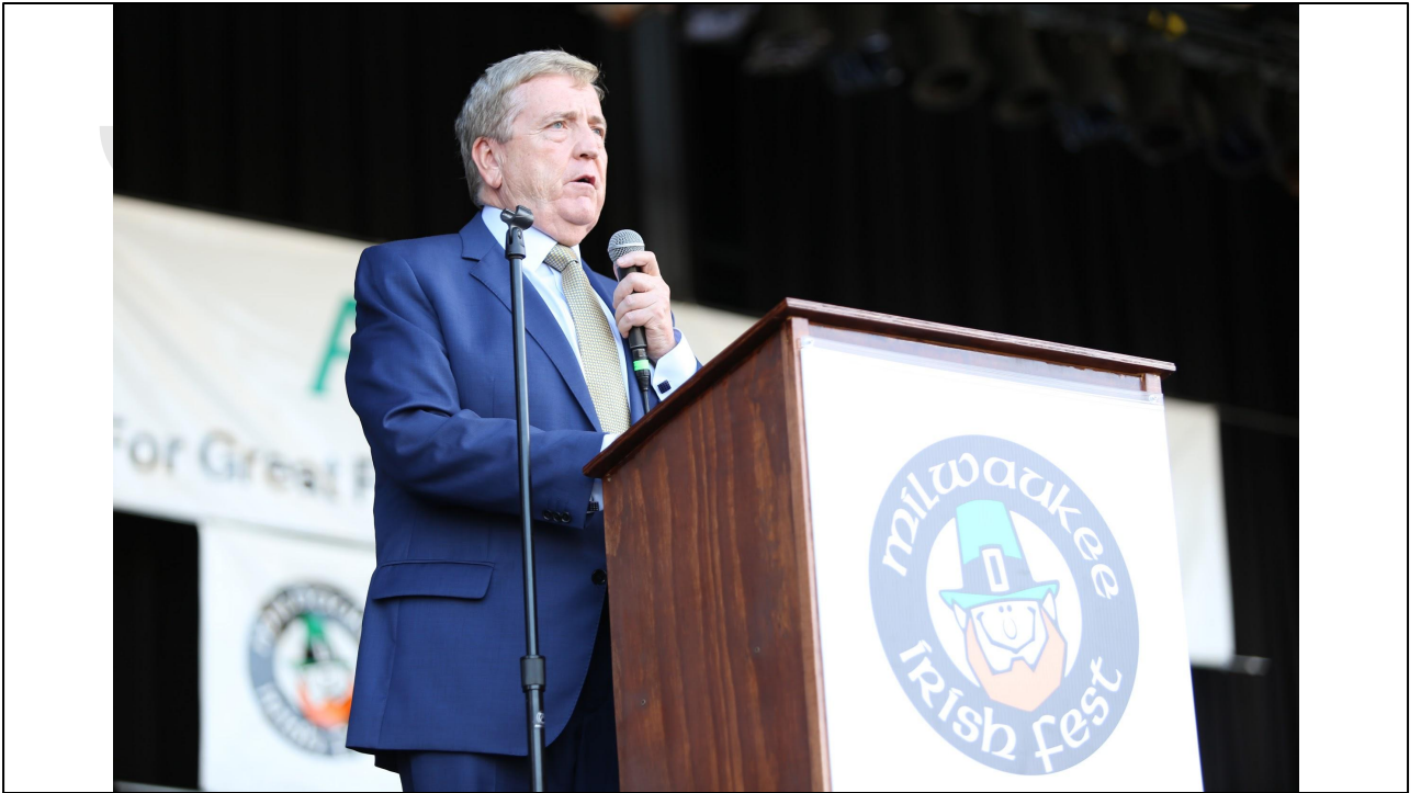
Minister Breen speaking at Irish Fest