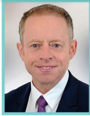
Ciarán Cannon T.D.

Minister of State for the Diaspora and International Development