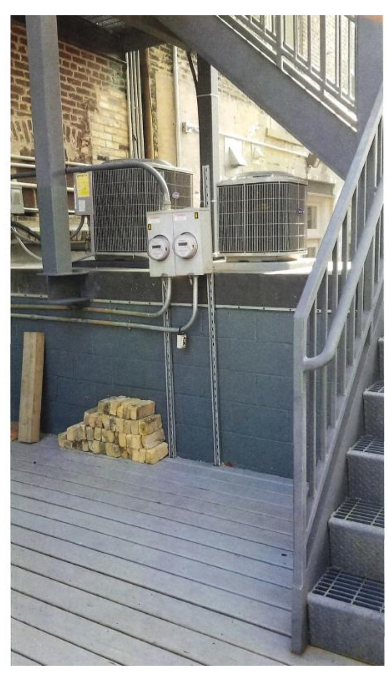
A/C units as installed