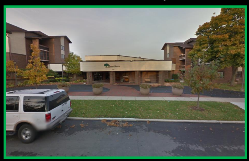
View from North 97th looking west