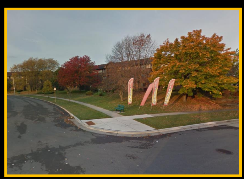
View from North 97<sup>th</sup> and North Michele Street