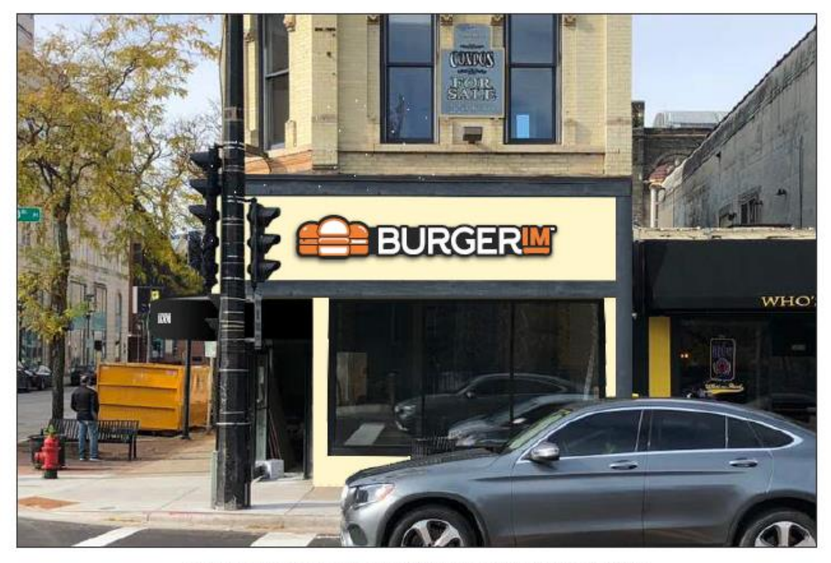
PROPOSED STOREFRONT ELEVATION - SCALE: 3/16"=1'-0"

Old World 3<sup>rd</sup> Street elevation