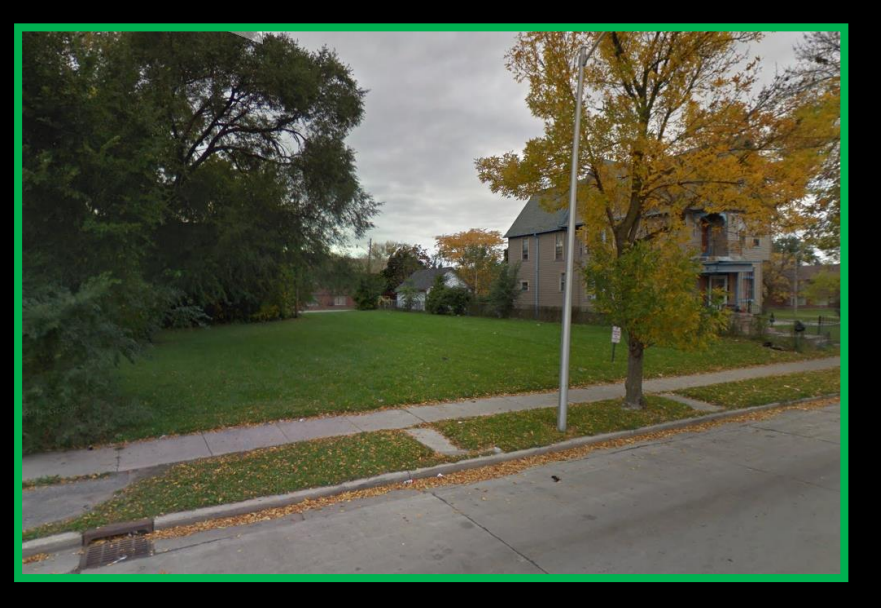
View from North 26<sup>th</sup> Street looking north-west