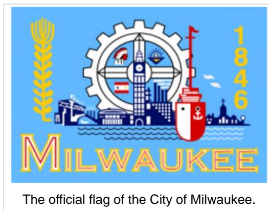
The official flag of the City of Milwaukee.