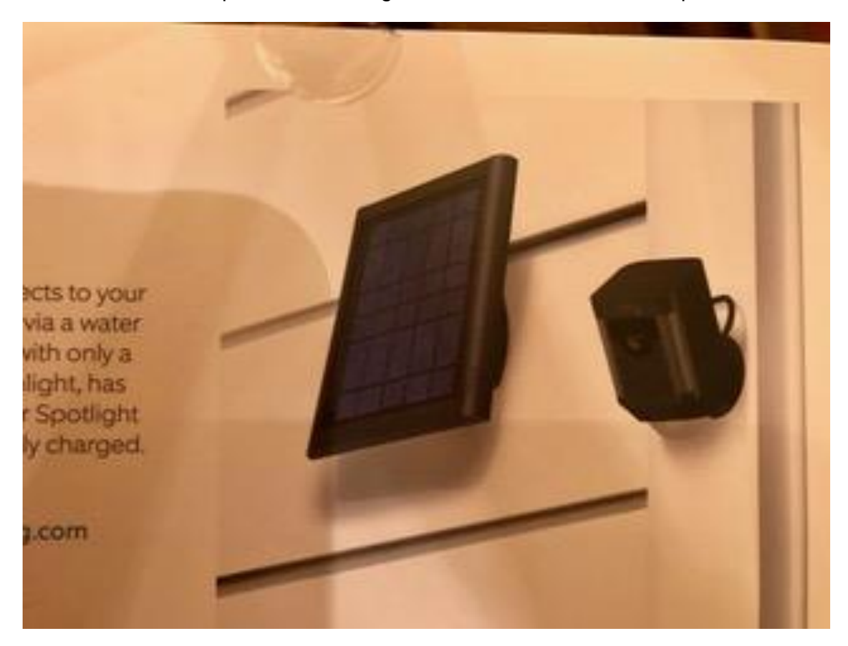
Camera model and solar panel

Mount cameras and panels to building wall at location shown. Solar panels mut be below fence height.