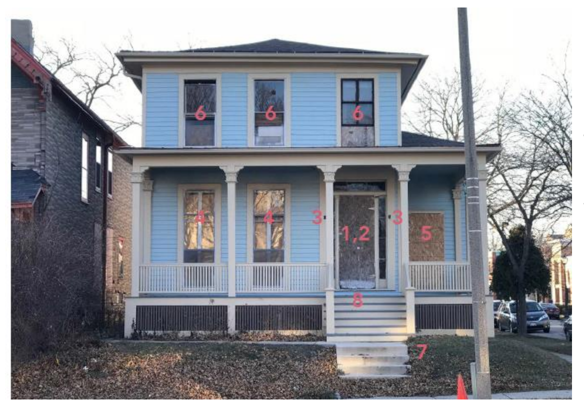
Copies to: Development Center, Ald. Milele Coggs, Contractor

The door numbered 5, at right, will be replaced with the wood window shown on the following page. New trim shall match existing window trim on the house.