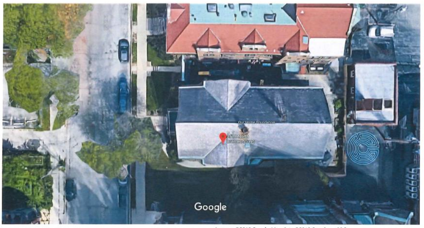
Imagery @2018 Google, Map data @2018 Google 20 ft