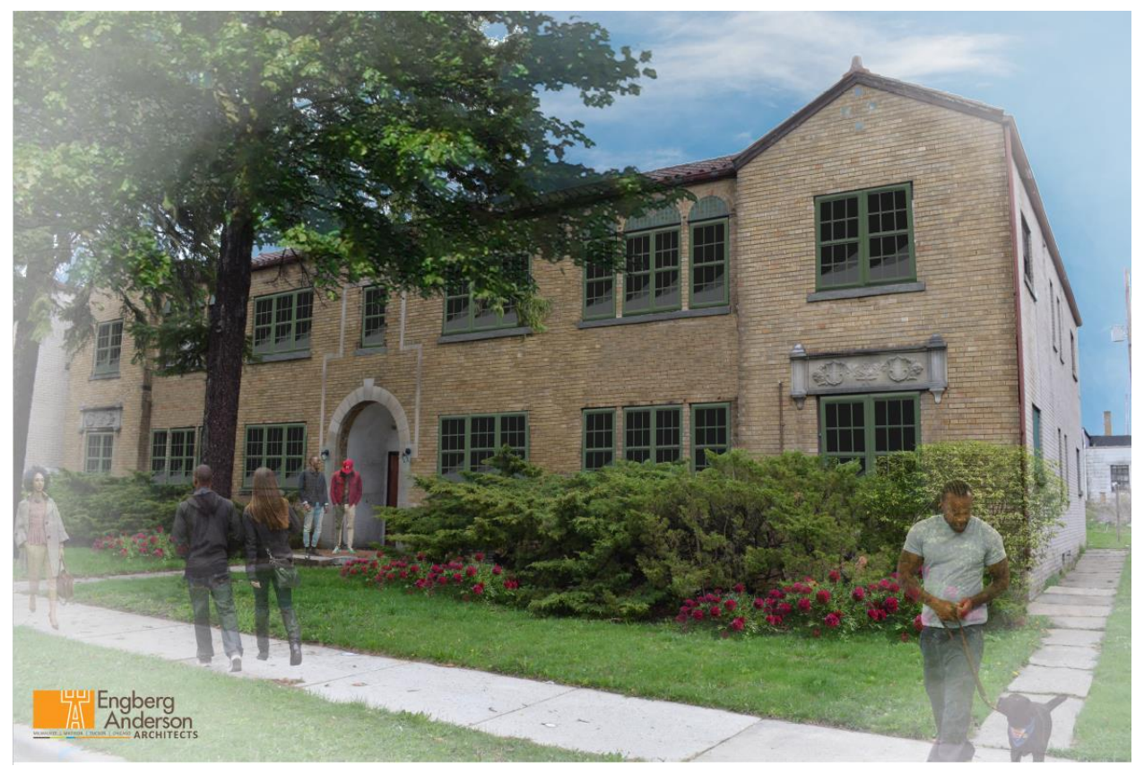
CITY MULTI-FAMILY PROPERTY AFTER RENOVATIONS

Certain City approvals may be required in addition to the approval of the Land Disposition Report. Closing is contingent upon the Buyer obtaining all necessary approvals, financing and DCD's approval of the final building elevations.