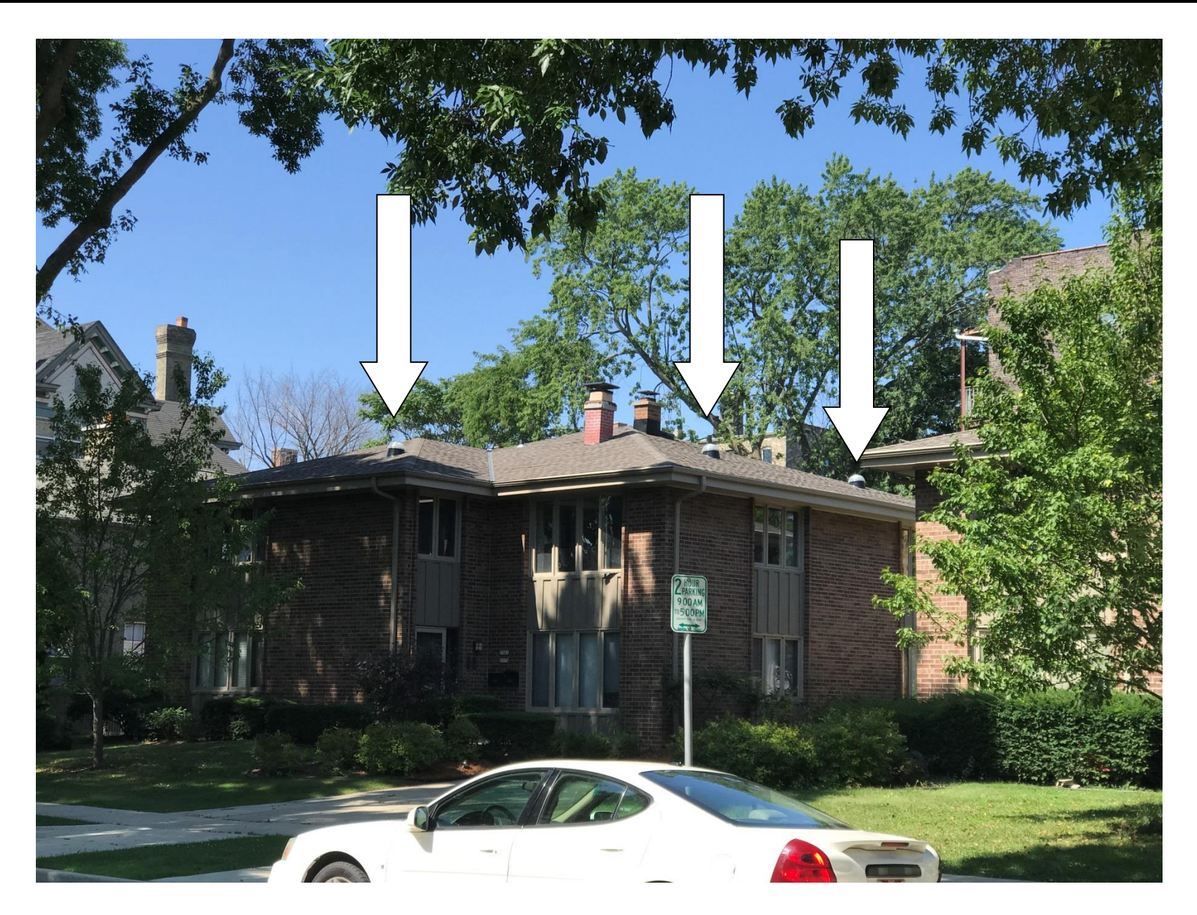
Front view showing three denied Solatubes.