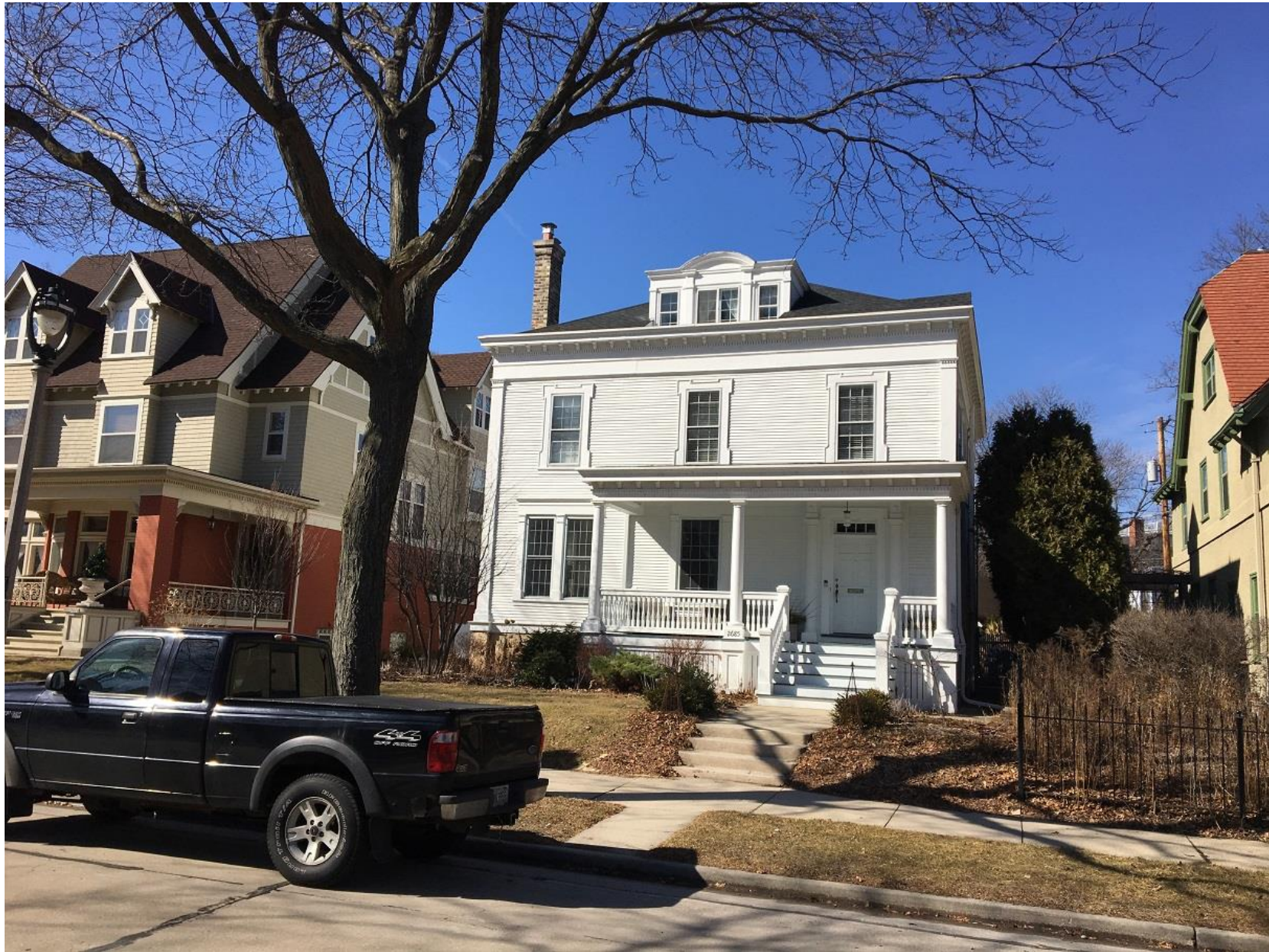
Front yard overview.