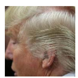
Donald Trump's Bizarre Hairdo Finally Explained