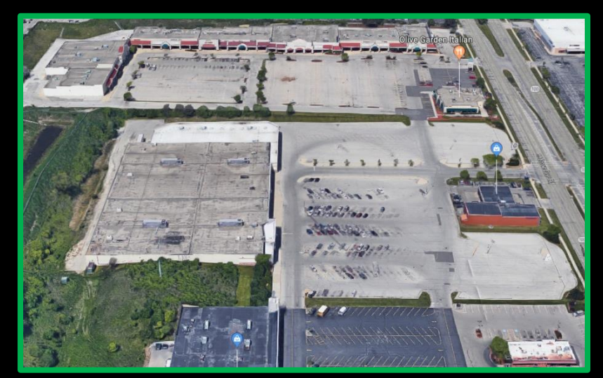
Aerial view west from adjacent lot