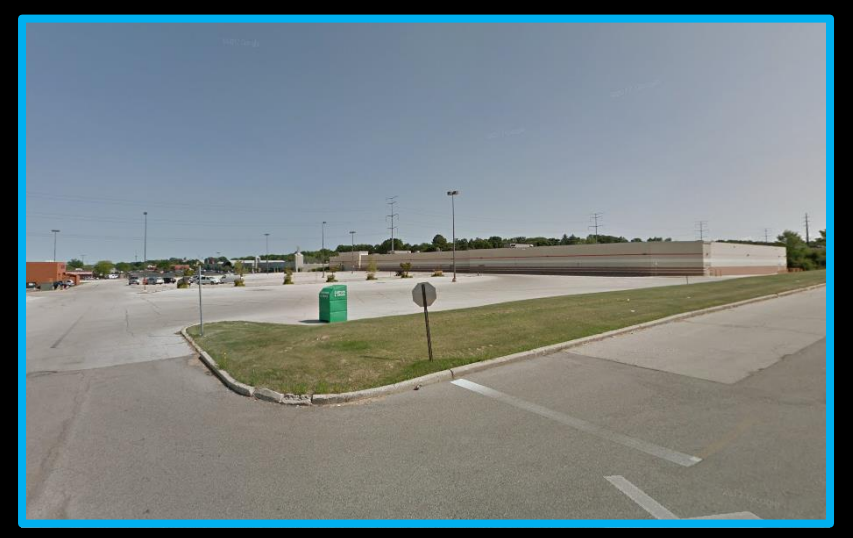
View southeast from west access road