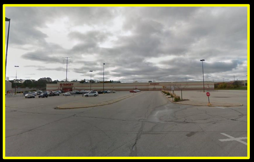
View south from entry off of West Brown Deer Road