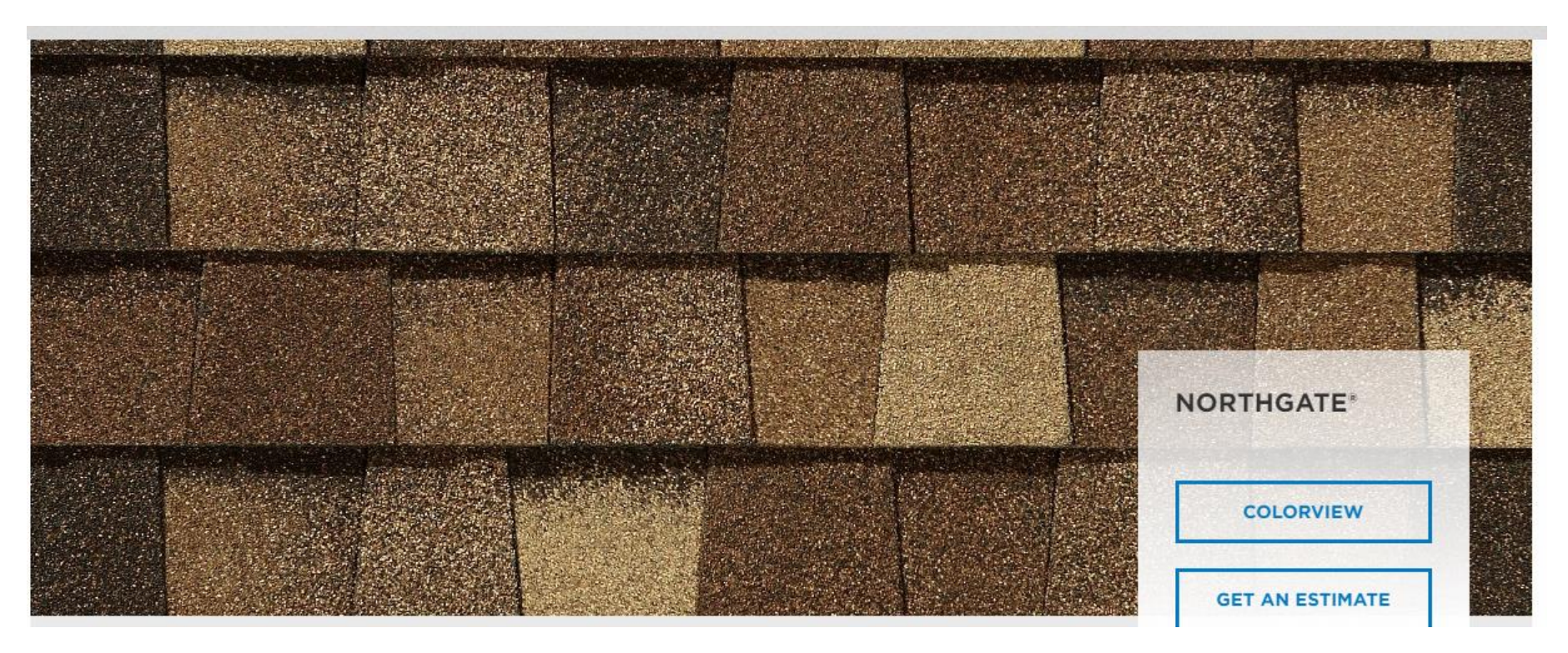
Approved shingle: Certainteed Northgate Resawn Shake