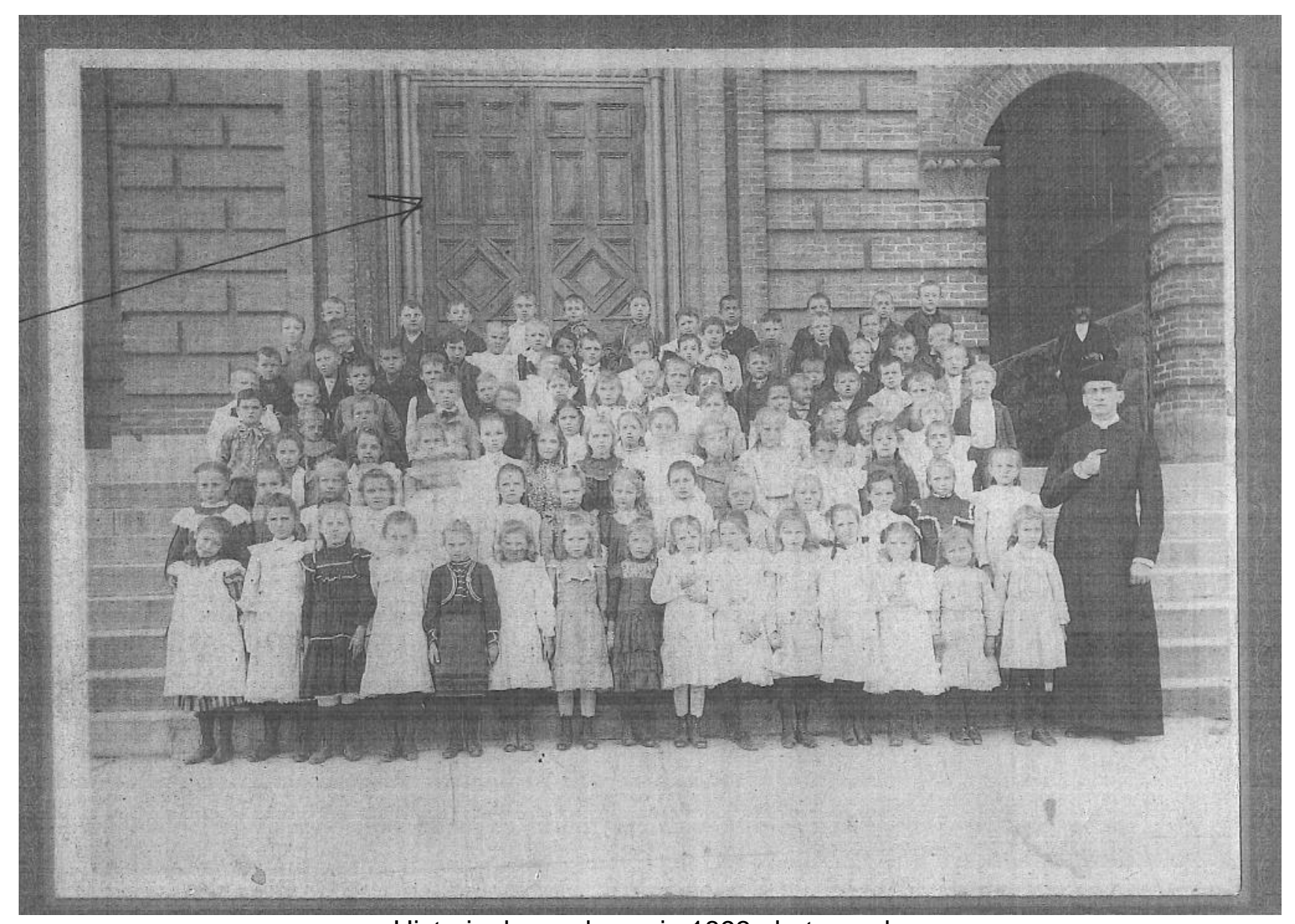
Historic doors shown in 1893 photograph.