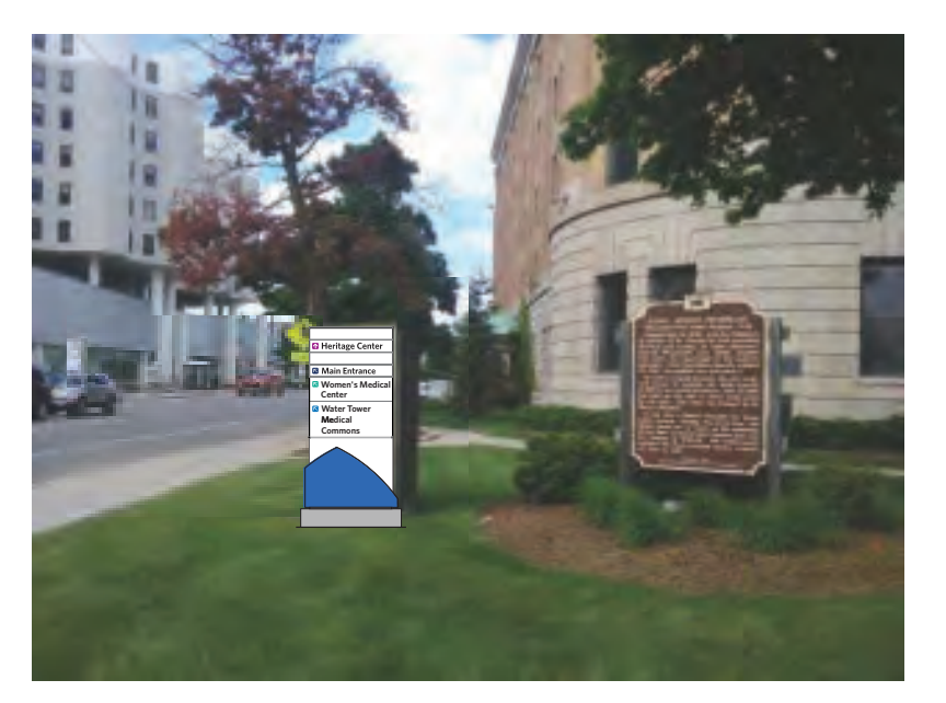
Recommended - Side A