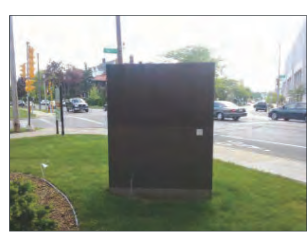
Detail Side B