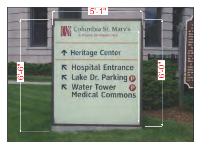
Detail Side A