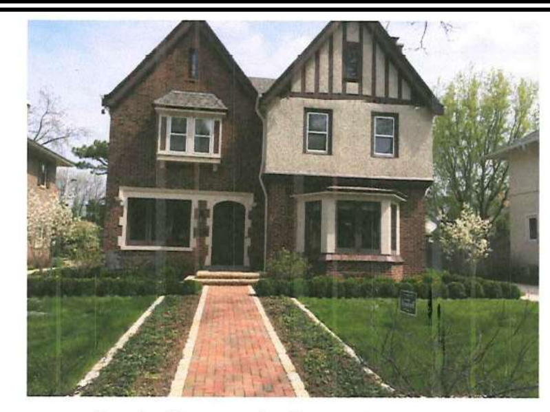
Front of house – looking east