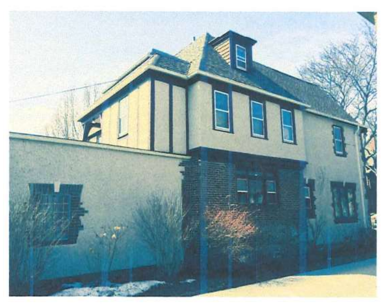
Side of house - looking south