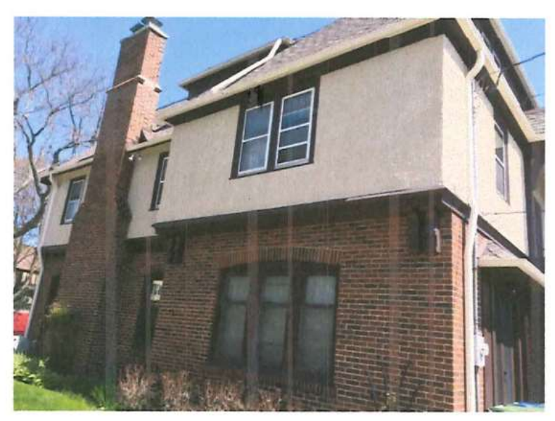
Side of house – looking north