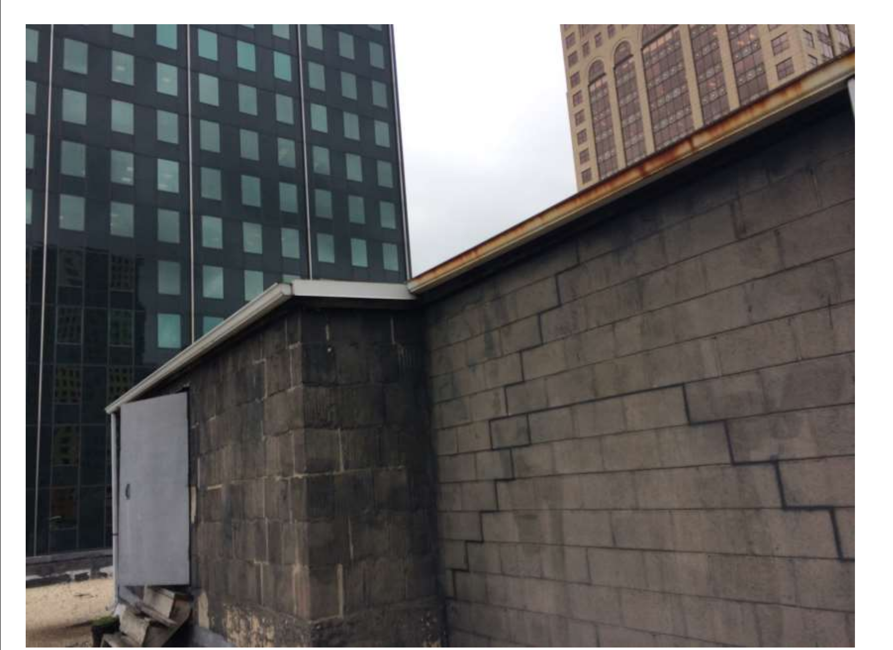
Penthouse showing fascia and gutters to replace