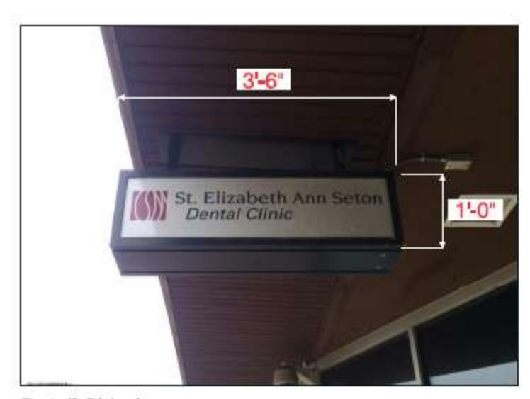
Detail Side A