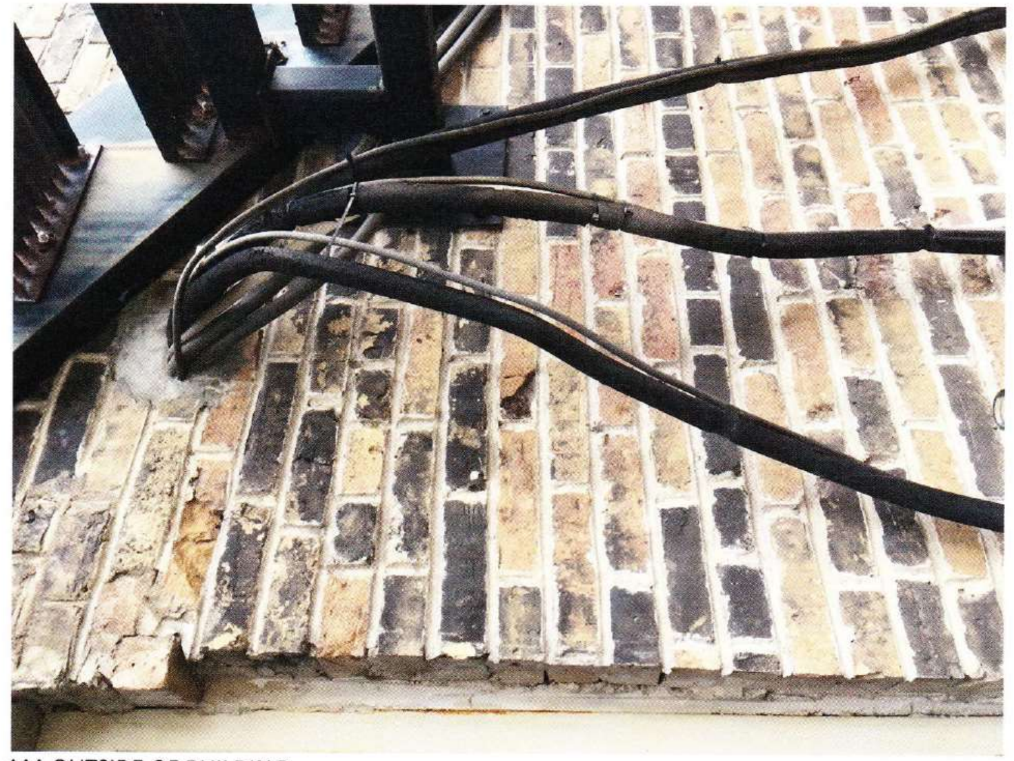
^^^ OUTSIDE OF BUILDING

Installation area beneath fire escape stairs. Metal vent must to painted to match brickwork.