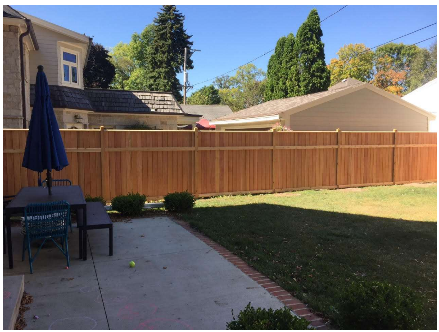
Approved fence design. Fence shall be painted or stained (opaque stains preferred).