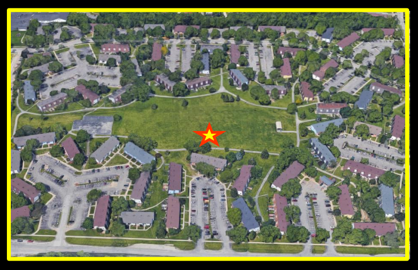
Arial view west from N. Swan Road