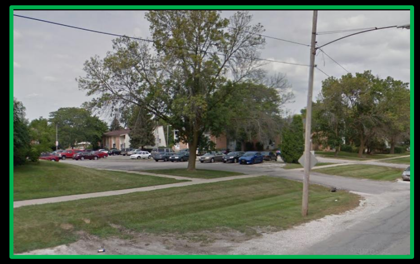
View northwest from N. Swan Road