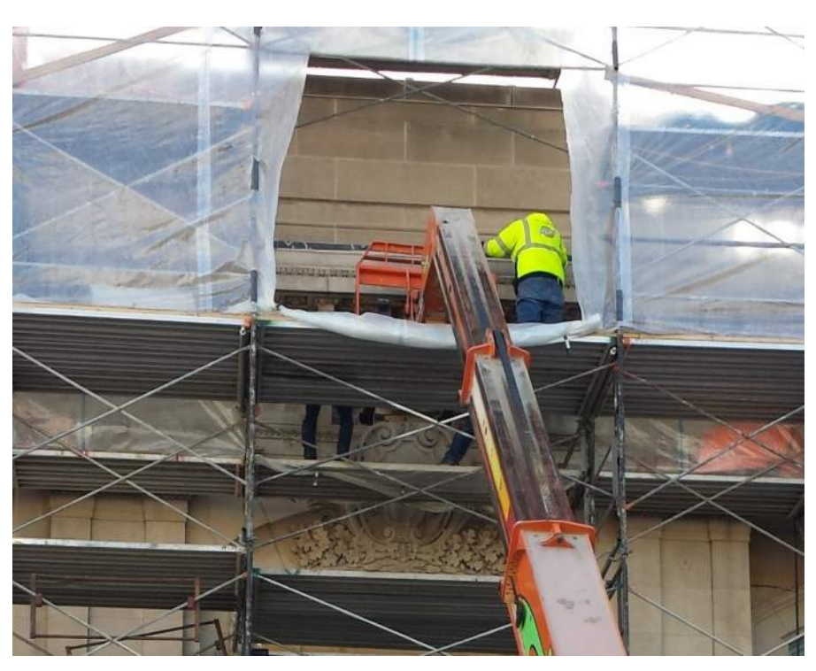
Photos 33, 34 – WEST ELEVATION. Northwest cartouche keystone, repositioned into place with specially fabricated steel hoist system attached to original keystone decoratively carved Indiana limestone block.