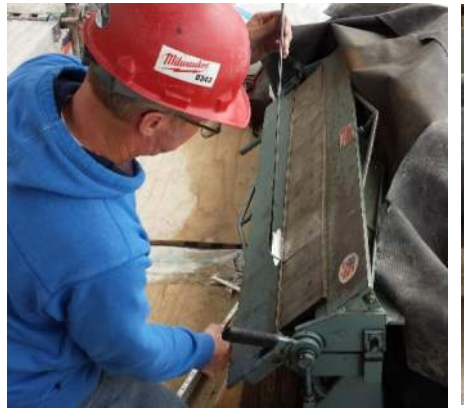
Photo 10 – Roofing/flashing tradesman, bending stainless steel for material development on-site of ad-hoc expansion joint at non-existent cornice drain location.