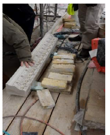
UJE ST ELEN