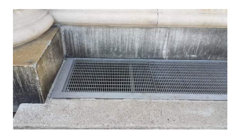
Photo 36 – WINDOW AREA WELL GRATE. O247. West elevation, grate no. 8, typical. Installation of new stainless steel grates, frames, fasteners. Annual maintenance required for "tea stains" resulting from oxidation (superficial only) caused by seasonal use of chemical deicers.

Milwaukee County Historical Society – Exterior Renovation Cornice / Parapet Field Report 01 Photographs – February 21, 2018 Milwaukee County No. 0118-13449 0247-16440 UW-RS PN: 16-118