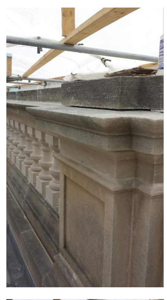
Photo 18 – West elevation. Open parapet railing capstones set. Solid pier cap shimmed for resetting. Solid pier stones repointed.