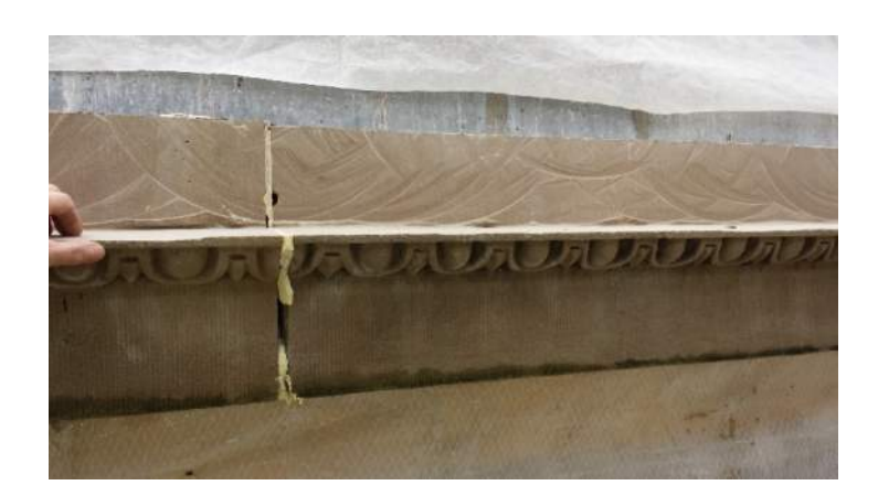
Photo 4 – East elevation. Removed the damaged stone. Note the successive lowering of the hand-held saw to the horizontal cut made, in the vertical cut.