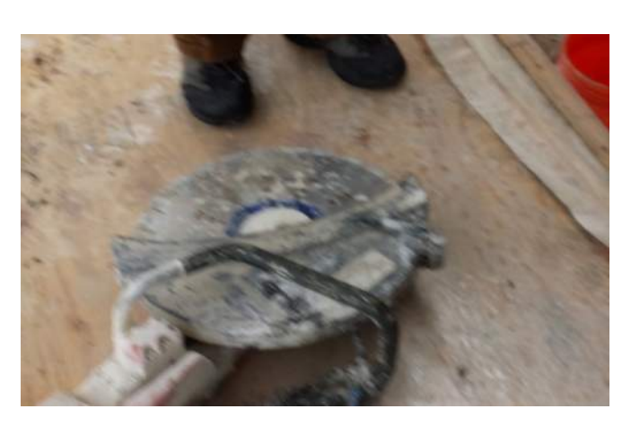
Photo 2 - Hand-sawn, no jig, removal of the damaged cornice gutter edge.