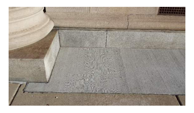
Photo 38 – Window area well grate no. 3 with new concrete cap and concrete support structure beneath. This area well was not draining and in heavy rain conditions would overflow into the lower level storage area. Concrete cap approved by the Historic Preservation Commission and Certificate of Appropriateness released 11/09/2017.