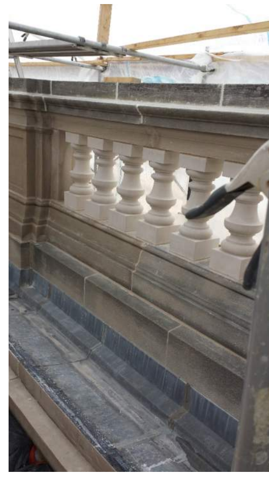
Photo 19 – West elevation. Second bay from the northern end, completely reset with new balusters. Railing capstones reset in restored, solid mortar joints. Special mortar for historic structures, for match in color, texture and structural stability.

Photo 18 – West elevation. Open parapet railing capstones set. Solid pier cap shimmed for resetting. Solid pier stones repointed.