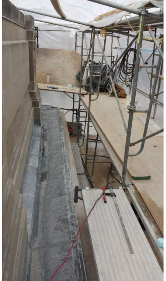
Photo 20 – West elevation, view from southern end. Parapet railing capstones reset. Cornice gutter edge removed by saw-cutting. Removal of existing flashing, in progress.

Photo 19 – West elevation. Second bay from the northern end, completely reset with new balusters. Railing capstones reset in restored, solid mortar joints. Special mortar for historic structures, for match in color, texture and structural stability.