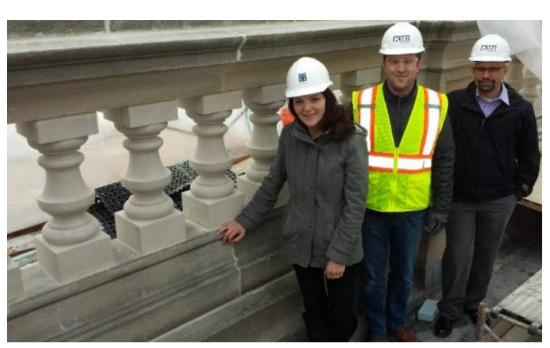
Photo 21 – West elevation, with the new balusters of second bay from the northern end.

Photo 20 – West elevation, view from southern end. Parapet railing capstones reset. Cornice gutter edge removed by saw-cutting. Removal of existing flashing, in progress.