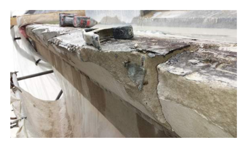
Photo 1 – O118 CORNICE GUTTER EDGE Southeast elevation. Existing condition with flashing removed. Nails shown held "filler" in-place. Damage done by power-fastening gutter flashing.