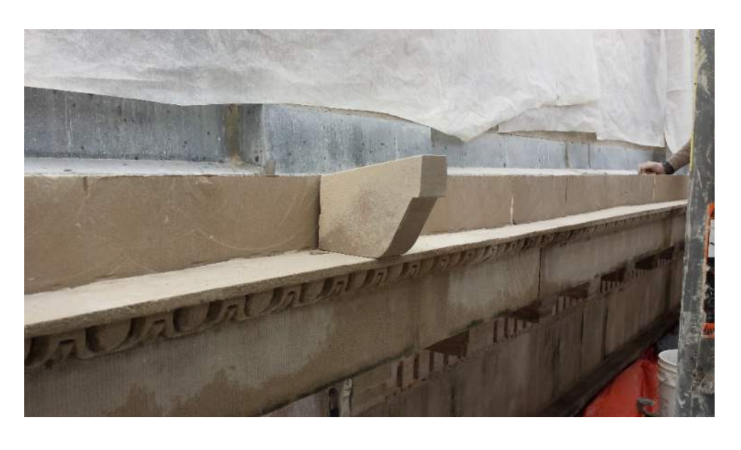
Photo 6 – East elevation. Preparatory work, sample Dutchman element, verifying drainage allotment and horizontal setting-bed.