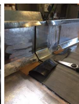
Photo 11 – IN SHOP MOCK-UP. Roofing/flashing tools, ad-hoc expansion joint for review.