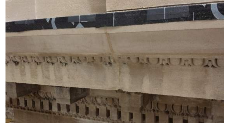
Photo 8 - West elevation. Installed, mortar-joint, cornice edge Dutchman. Waterproofing membrane laps over substrate of treated plywood with stainless steel end channels at border for continuous rigidity between plywood panels. Pending gutter flashing.