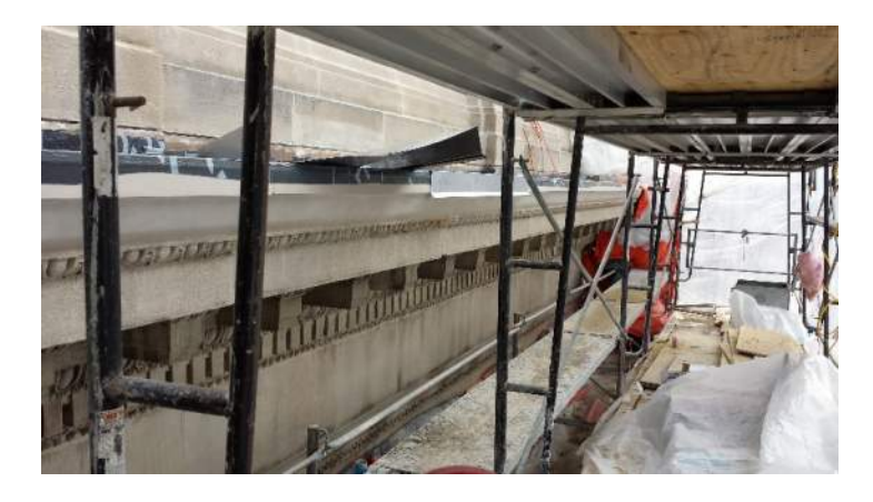
Photo 9 – West elevation. CORNICE GUTTER FLASHING. Lead-coated copper with expansion joints mock-up, in progress.