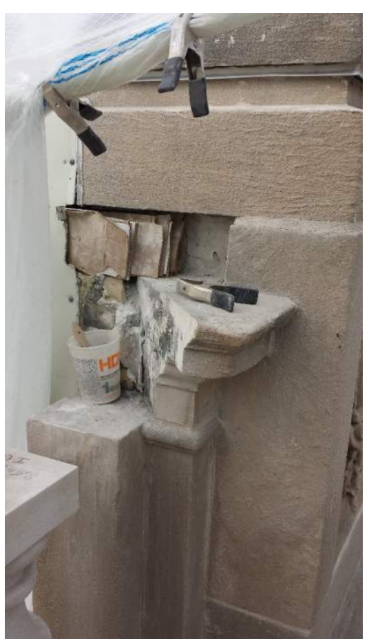
Photo 16 - West elevation. Tradesman tools for cleaning, repointing mortar joints. Severely degraded stones, previously assessed are removed and replaced with carved replicates. Note stainless steel flashing at solid parapet capstone.

Photo 15 – East elevation at northern-end. Setting of bay with newly carved balusters. Parapet railing caps being set. One hundred percent of existing mortar joints cleaned, repointed. All newly carved balusters are positioned on the east elevation, two northeast bays, as the least visible location for subtle difference in color, intially.