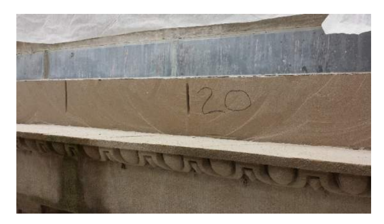
Photo 7 – East elevation. Placement corresponding to field measured stone Dutchman elements.