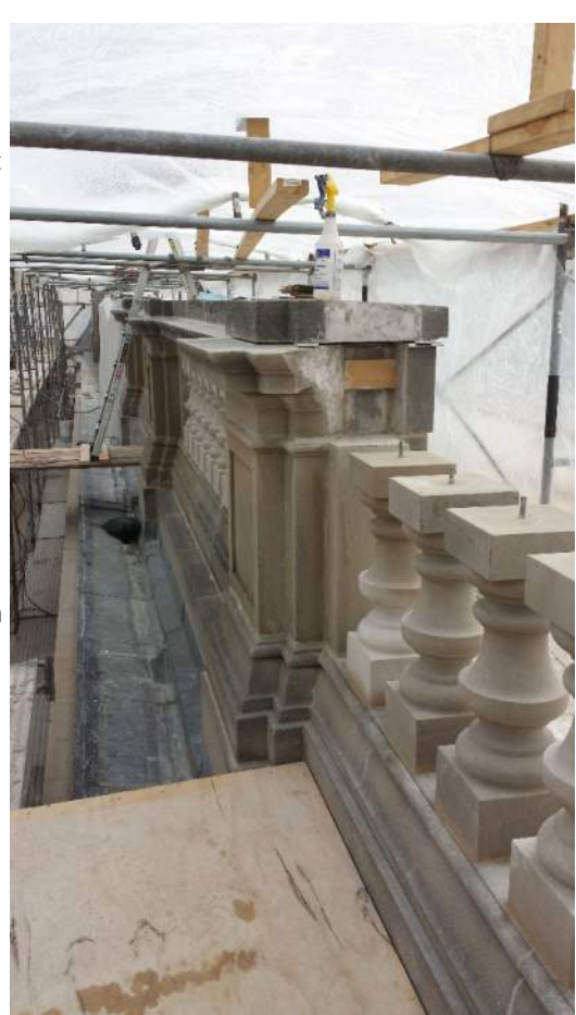
Photo 15 – East elevation at northern-end. Setting of bay with newly carved balusters. Parapet railing caps being set. One hundred percent of existing mortar joints cleaned, repointed. All newly carved balusters are positioned on the east elevation, two northeast bays, as the least visible location for subtle difference in color, intially.

Photo 14 -BALUSTRADE. West elevation at parapet - setting of parapet balusters. Existing balusters replaced the missing and/or damaged balusters at the northwest end elevation. This was for coordination of color, texture in a single bay at the most highly visible elevation.