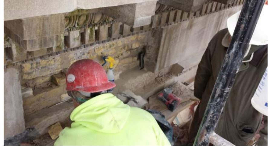
Photo 26 – North cartouche. Brick back-up wall restored, insertion of 0.0375mm steel plates for additional stabilization of facing stone, typical.