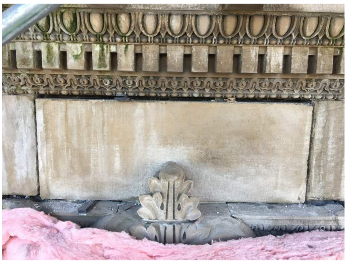
Photo 22 – CARTOUCHE. There are (7) cartouche made up of five elaborately carved stones. Structurally work under compression as the arch over windows, located beneath the solid parapet. North cartouche, upper veneer stone, just above the arch keystone (6" depth). Found condition of displacement, downward action.