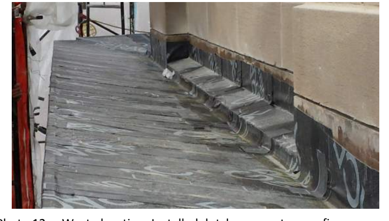
Photo 12 — West elevation. Installed dutchman, waterproofing membrane over treated plywood substrate on structurally sloped cornice gutter stone. Existing stone reglet, at back wall, cleaned and re-used at installation of the new metal counter-flashing.