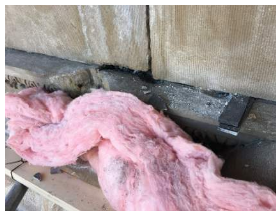
Photo 24 – Detail of past, unsuccessful intervention. Newly carved replacement stone band has been installed.

cartouche. Found condition of lower edge of displacement. Note insertion of dowels in the outer decorative stone band made in a past intervention. Unsuccessful and inappropriate solution for the displacement action taking place for the stone mass load.