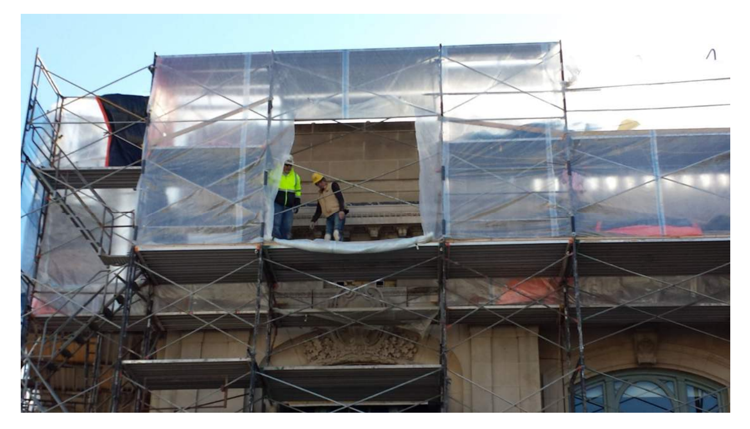
Photo 35 – WEST ELEVATION. Northwest cartouche keystone, repositioned into place.