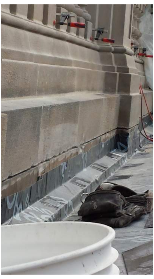
Photo 14 -BALUSTRADE. West elevation at parapet - setting of parapet balusters. Existing balusters replaced the missing and/or damaged balusters at the northwest end elevation. This was for coordination of color, texture in a single bay at the most highly visible elevation.