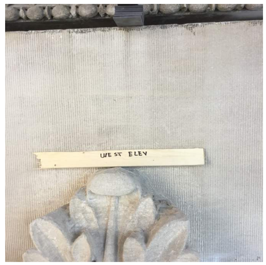
Photo 27 – NORTHWEST CARTOUCHE, upper stone. Found condition of displacement, downward settling action. First of seven (total) cartouche arch elements, assessed and subsequently to be re-set into place.