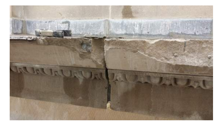
Photo 3 – East elevation. The horizontal cut is the first cut just above the carved egg and dart. Carefully made as this will seat the new Dutchman when damaged area is removed.