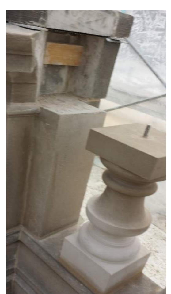
Photo 17 – West elevation. First bay at the northern end, newly-placed baluster with stainless steel dowel.

Photo 16 - West elevation. Tradesman tools for cleaning, repointing mortar joints. Severely degraded stones, previously assessed are removed and replaced with carved replicates. Note stainless steel flashing at solid parapet capstone.