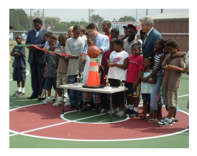
The youth were invited to assist with the ribbon cutting.