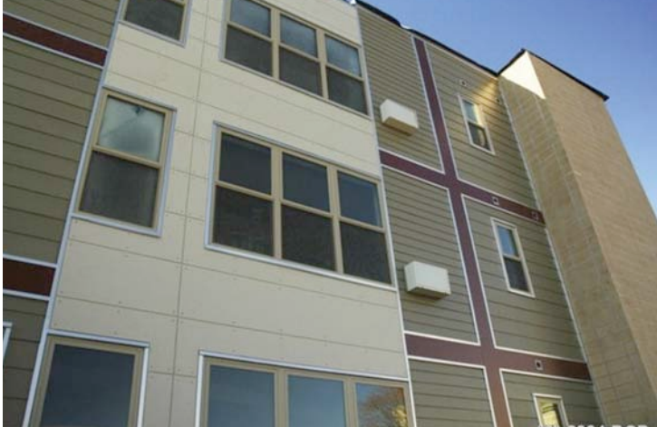
Residents will move into Prairie Apartments, 1218 W. Highland Ave., in early 2009.

a 24-unit building at 1218 W. Highland Ave., will be completed in January 2009. Guest House of Milwaukee and Heartland Alliance of Chicago teamed up to sponsor the development. The project will provide 24 new onebedroom and studio apartments with private baths and kitchens. Other amenities include a fitness center, technology