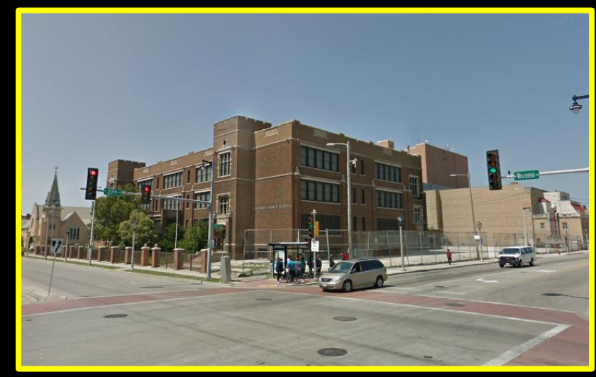
View northwest from W. Wisconsin Ave and N. 27<sup>th</sup> St.

View southwest from N. 27<sup>th</sup> St. & W. Hazelton Ct.