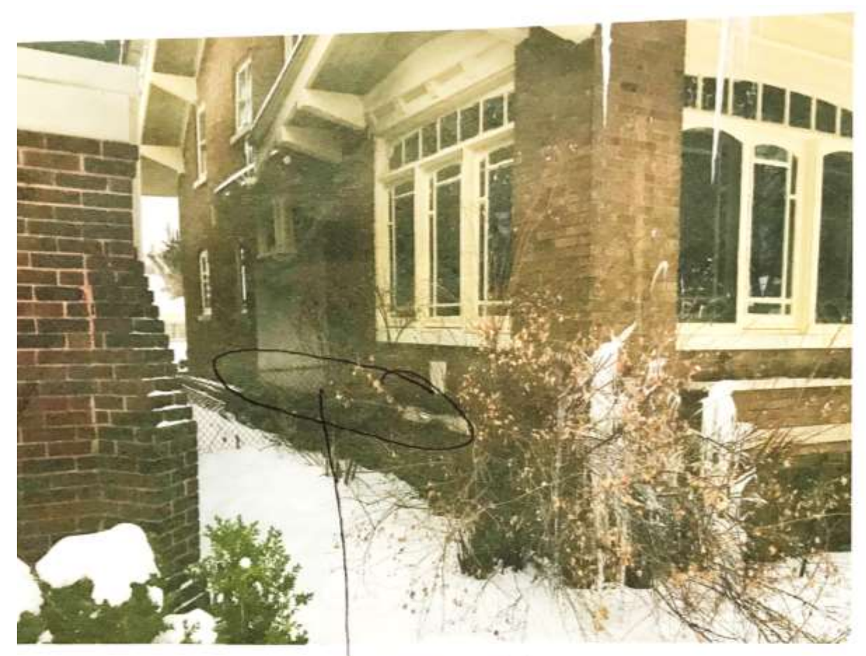
Z- Z" PUC VENTING OUT THIS SIDE OF THE HOUSE