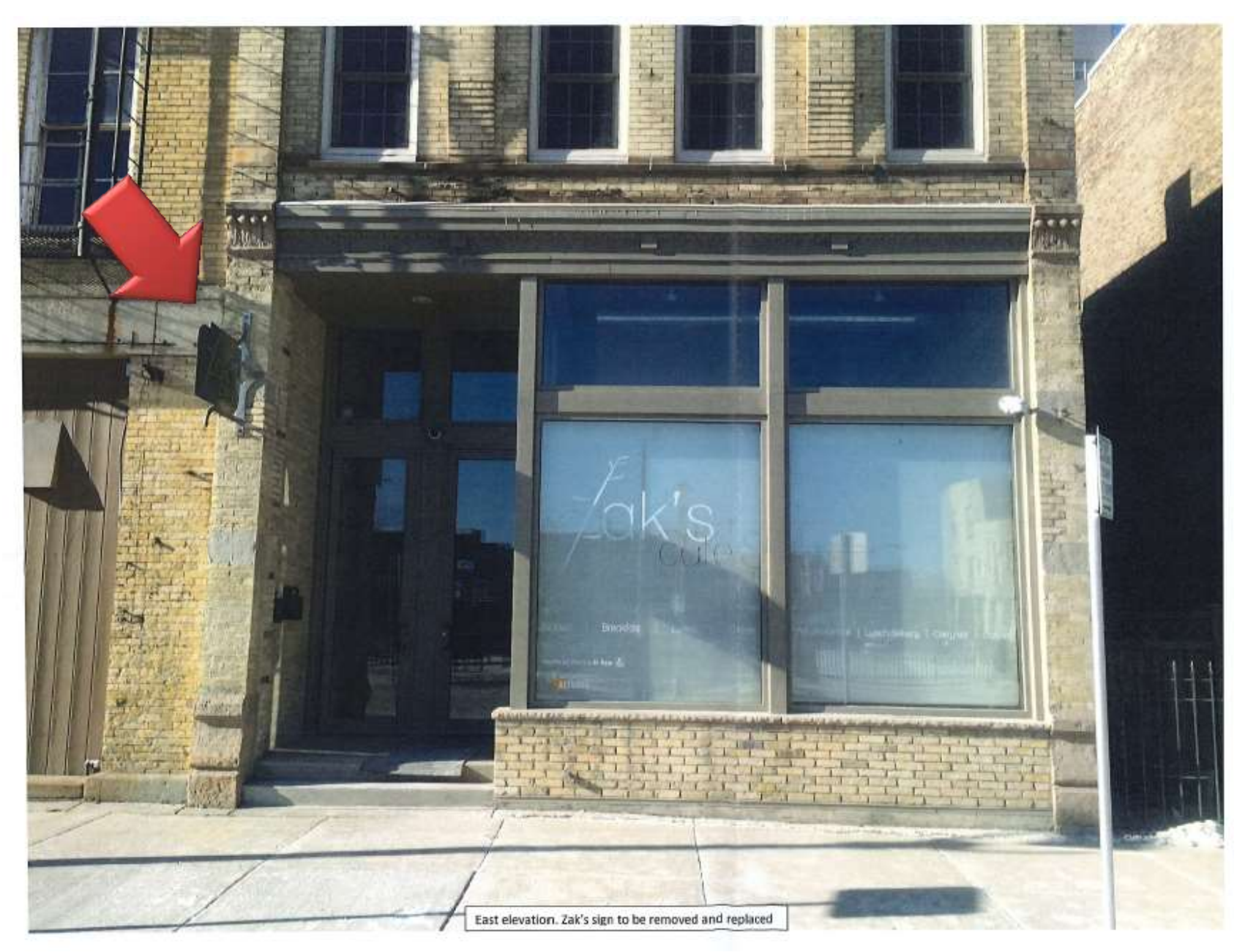
Sign to be removed and replaced in approximately the same location, at a code-compliant height.