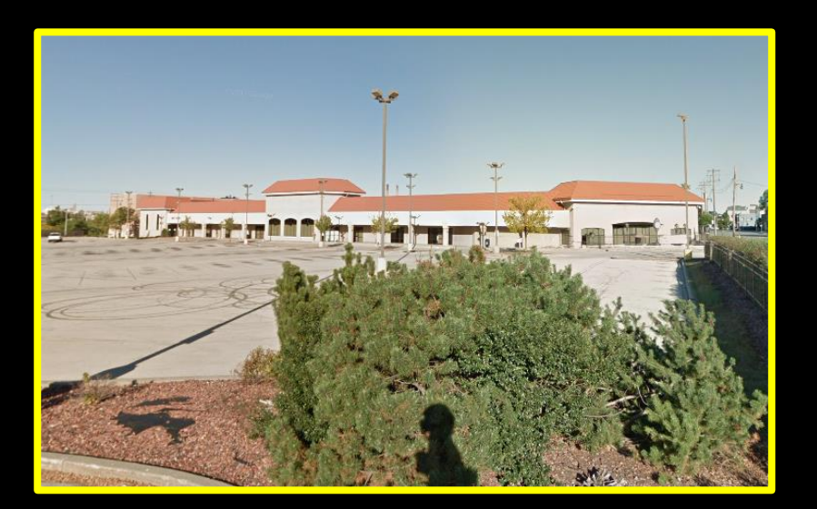
View northeast from South 19th Street