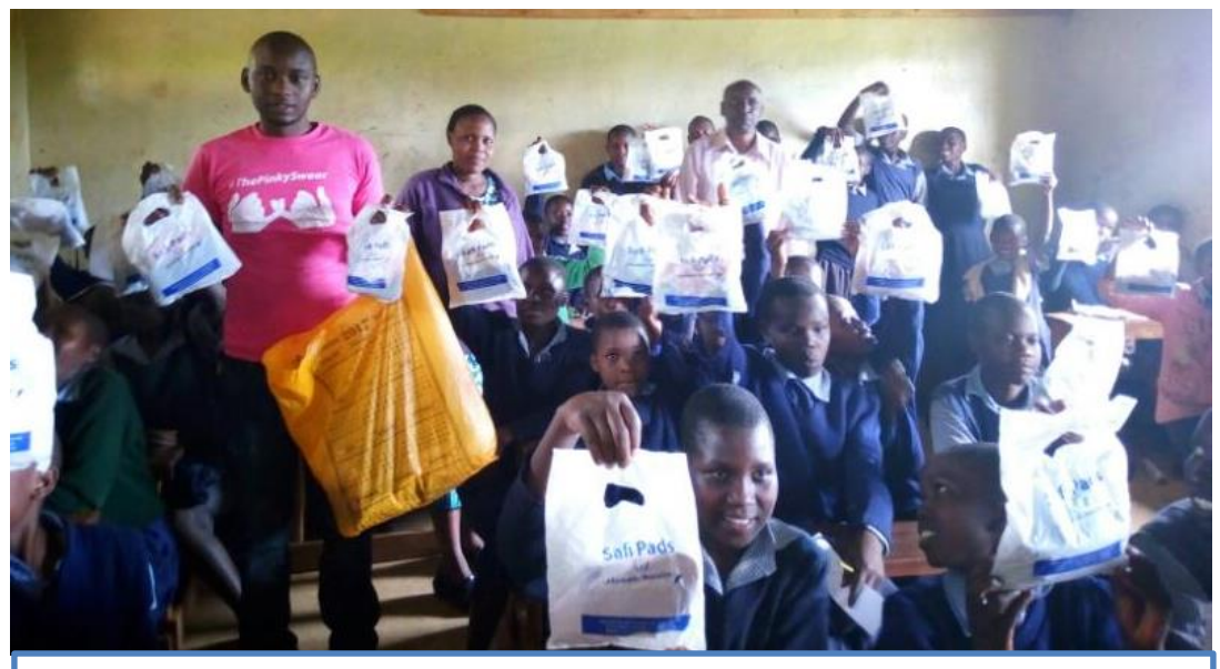
Bomet County School Girls Receiving Sanitary Napkins donated by MILAWA