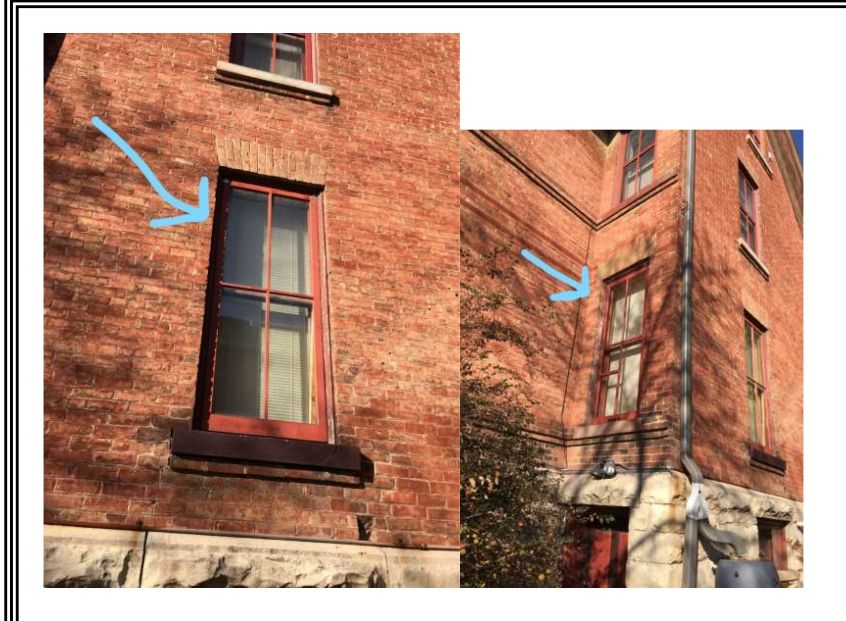
Typical windows to be replaced on house