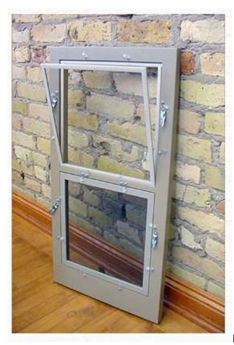
Replacement storm type