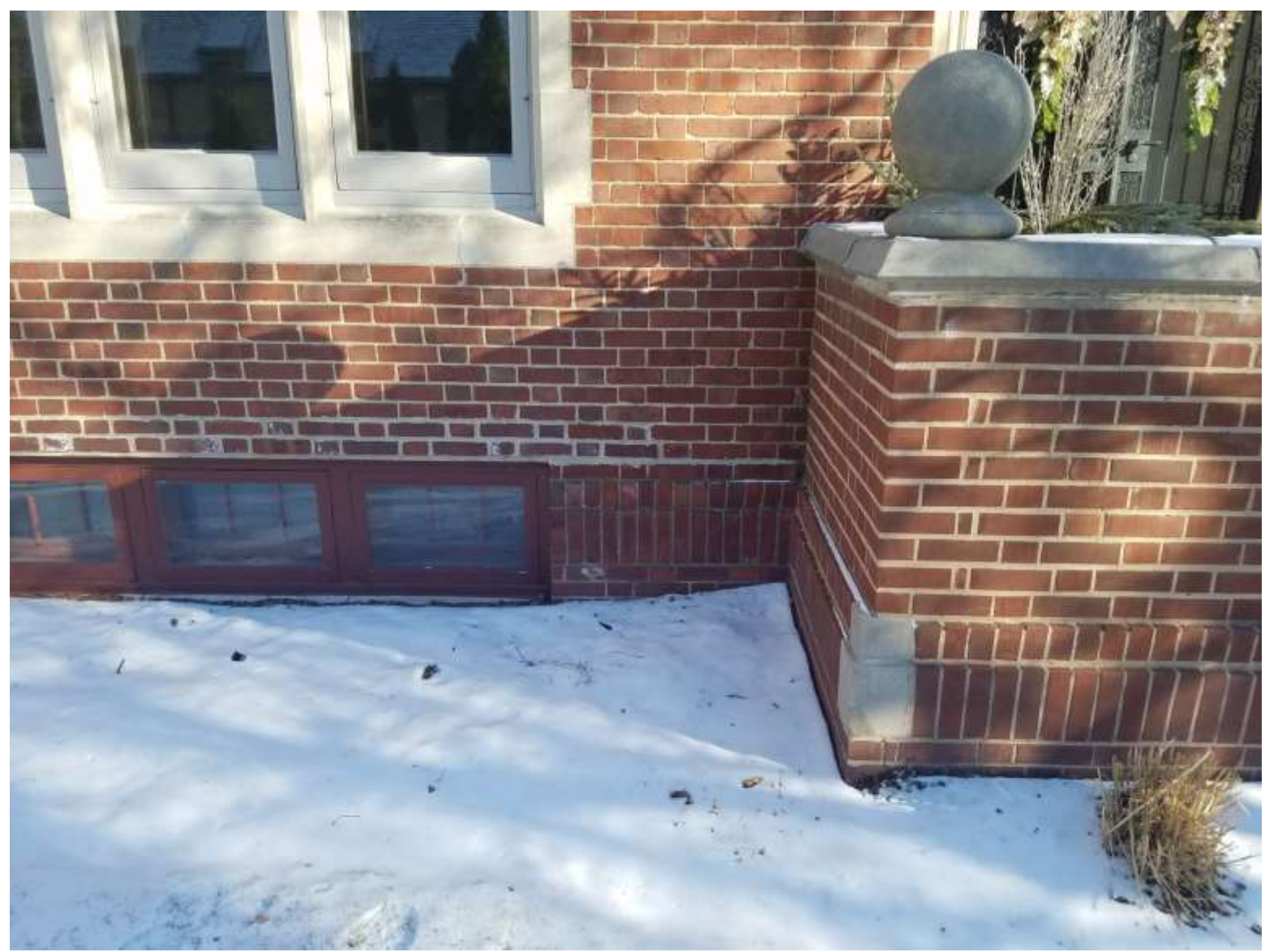
Install area is behind stair wall and in front of basement windows.