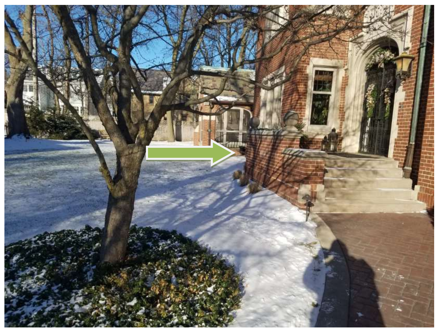
Install to rear (west) of stair wall