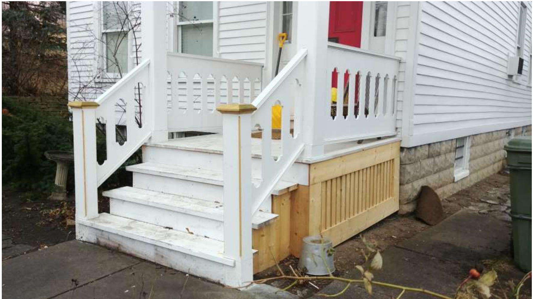
Nearly completed work. All wood must be painted.