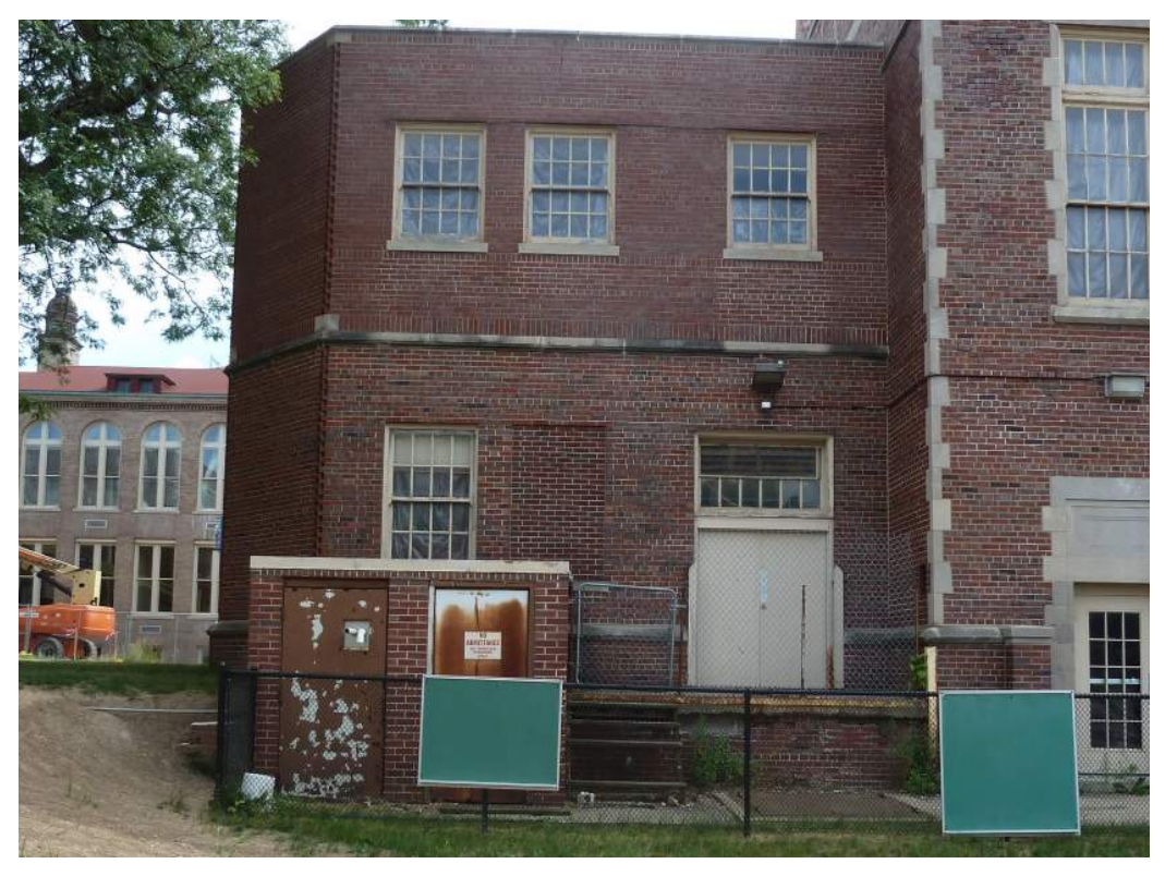
Photo 7 - North Elevation showing existing loading dock & coal-loading basement access addition