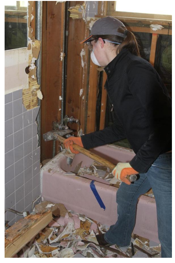
Demolition Demolition And More Demolition

Prior to any further rehab work being done, all Thirty units require extensive demolition work and debris removal. The scope of work on this Event included demolition of kitchens and bathrooms, which in some cases went down to the studs. Debris removal included carpeting and padding, built in kitchen cabinets, appliances, bathroom vanities and plumbing fixtures including steel & cast iron tubs.