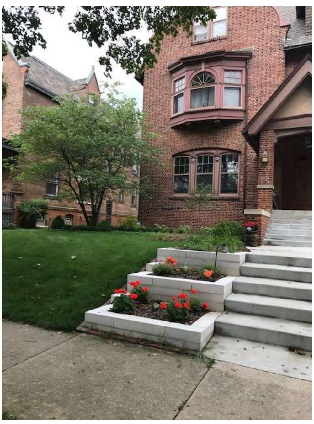
Present conditions 2