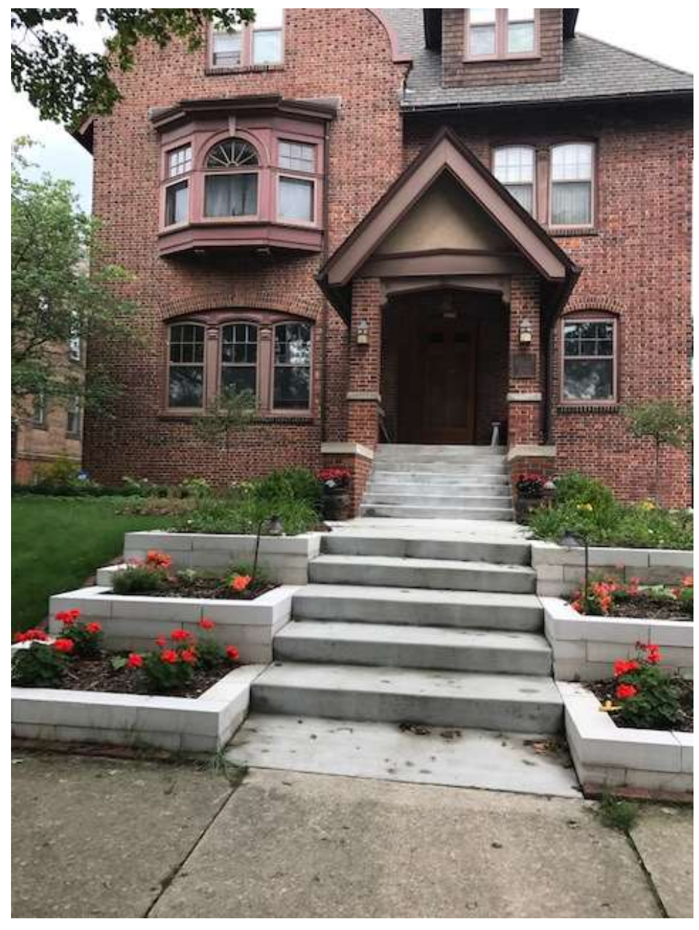
Present conditions 3