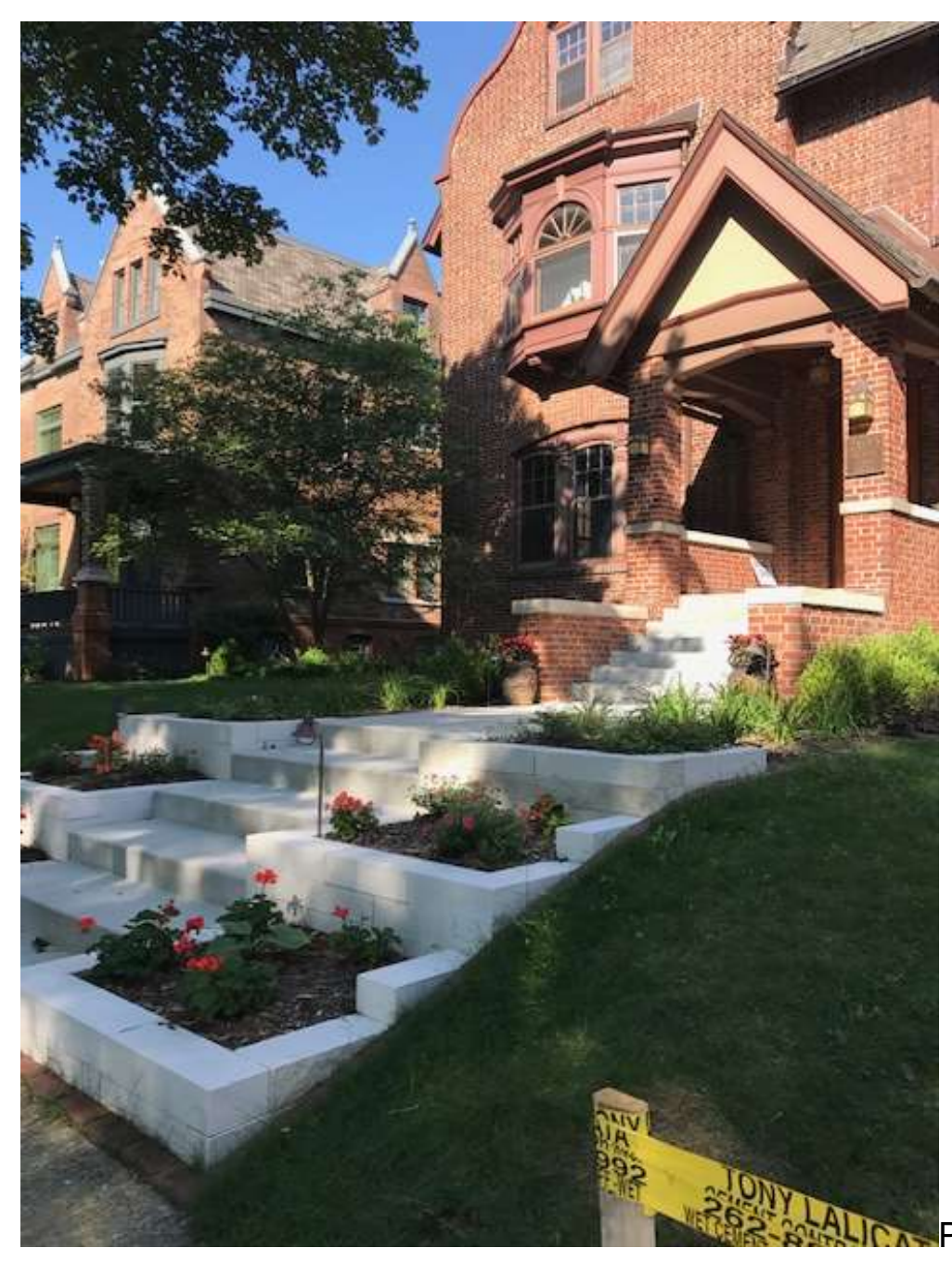
Present conditions 1