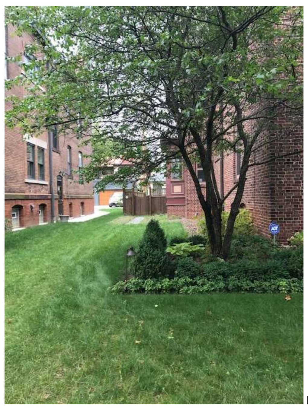
Present conditions 4