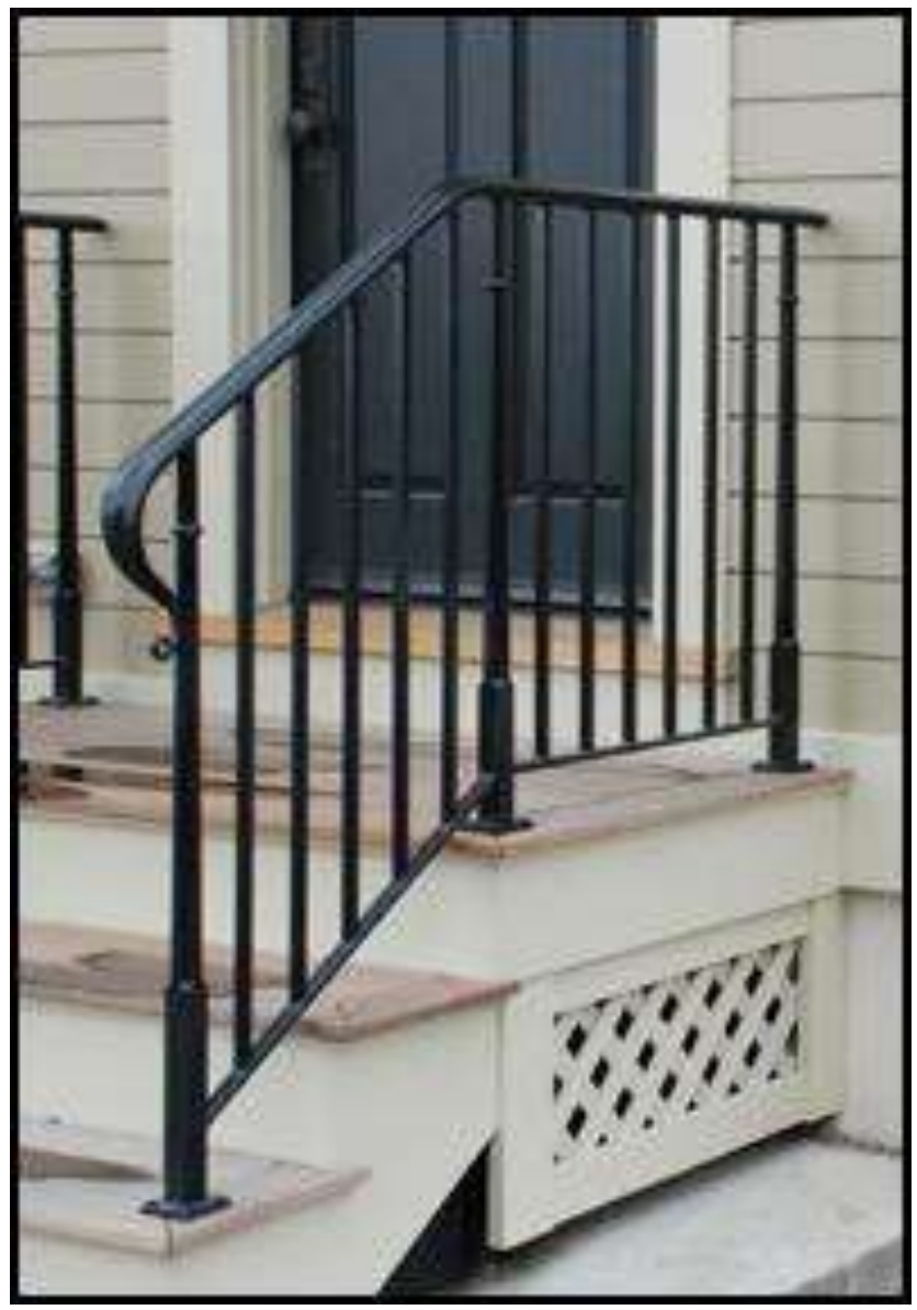
Sample metal railing design. Pickets are optional. Hinges that adjust the slope are not permitted.