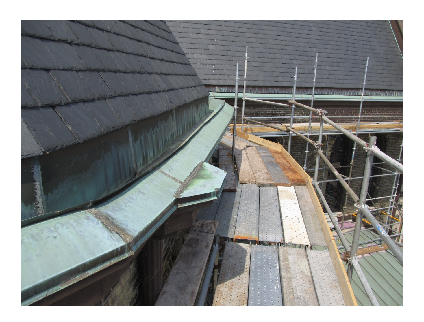
Photo 1 shows the 1972 copper gutter liner – which was leaking at holes, tears and split seams.