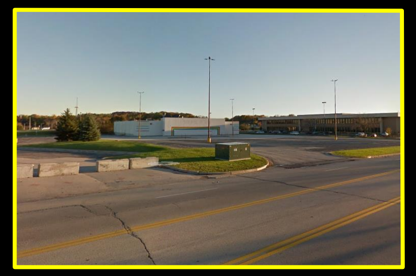
View south from Northridge Mall Road