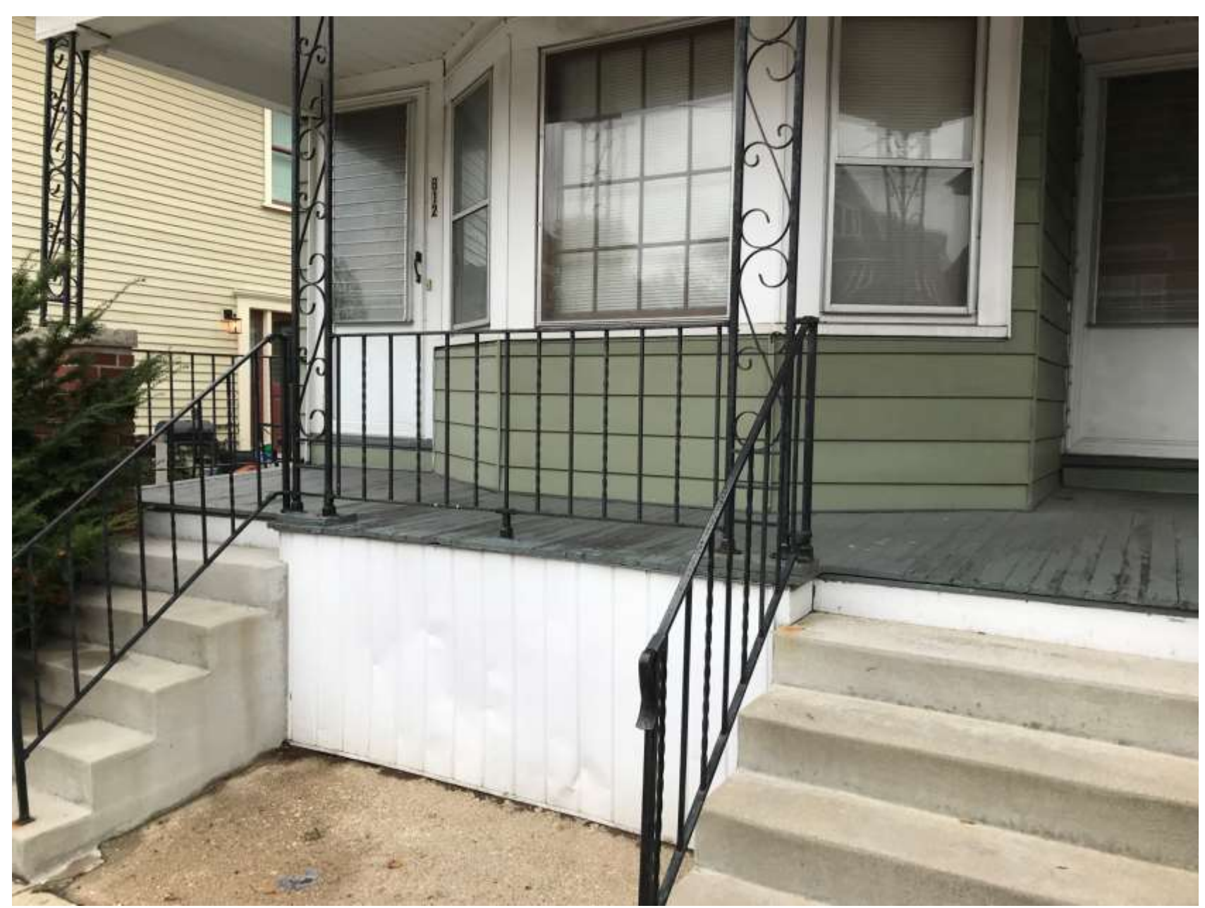
East end of porch is at left where work will be done replacing a board and re-installing existing railing.