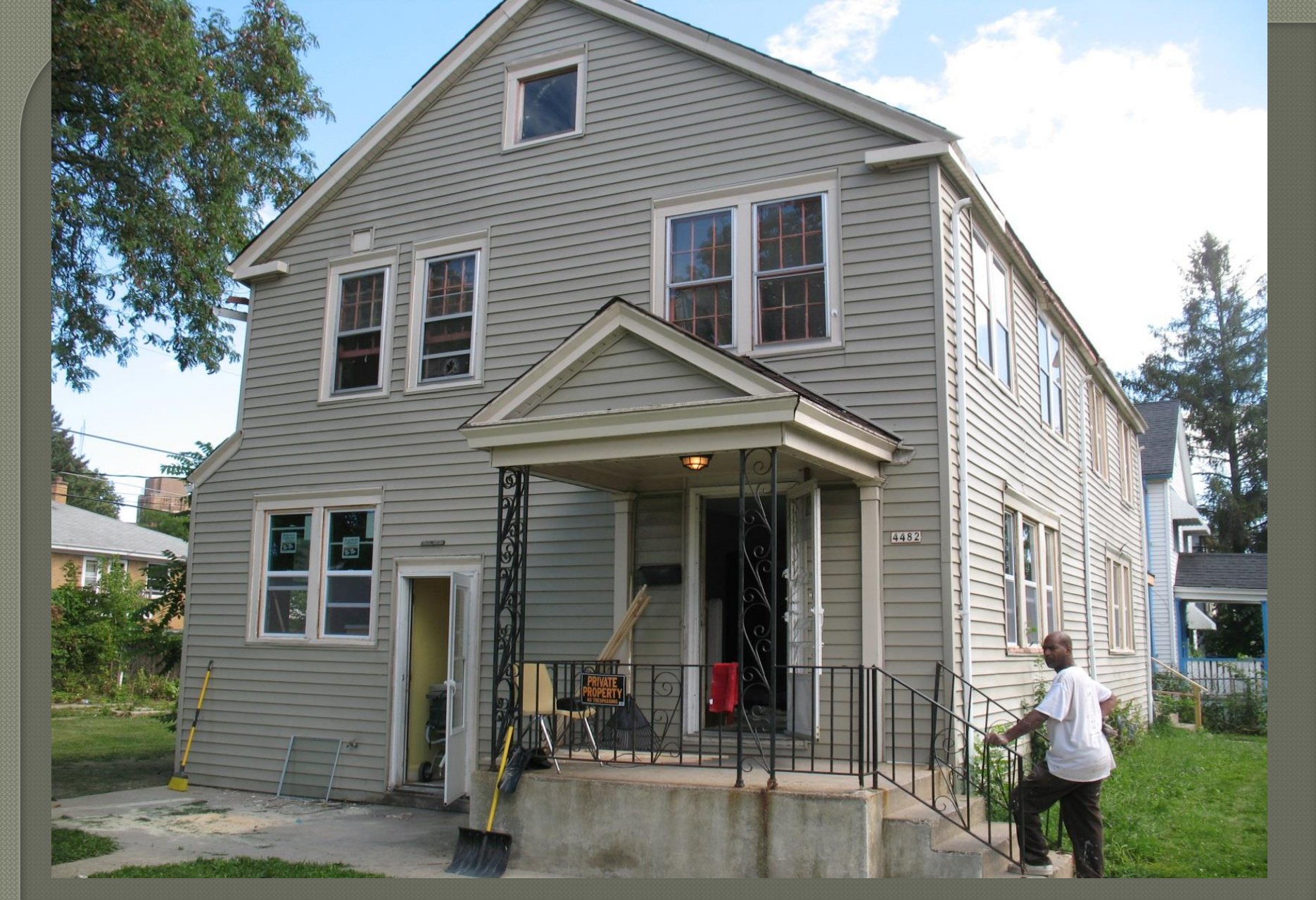
during work in progress. Main windows appear readily repairable.