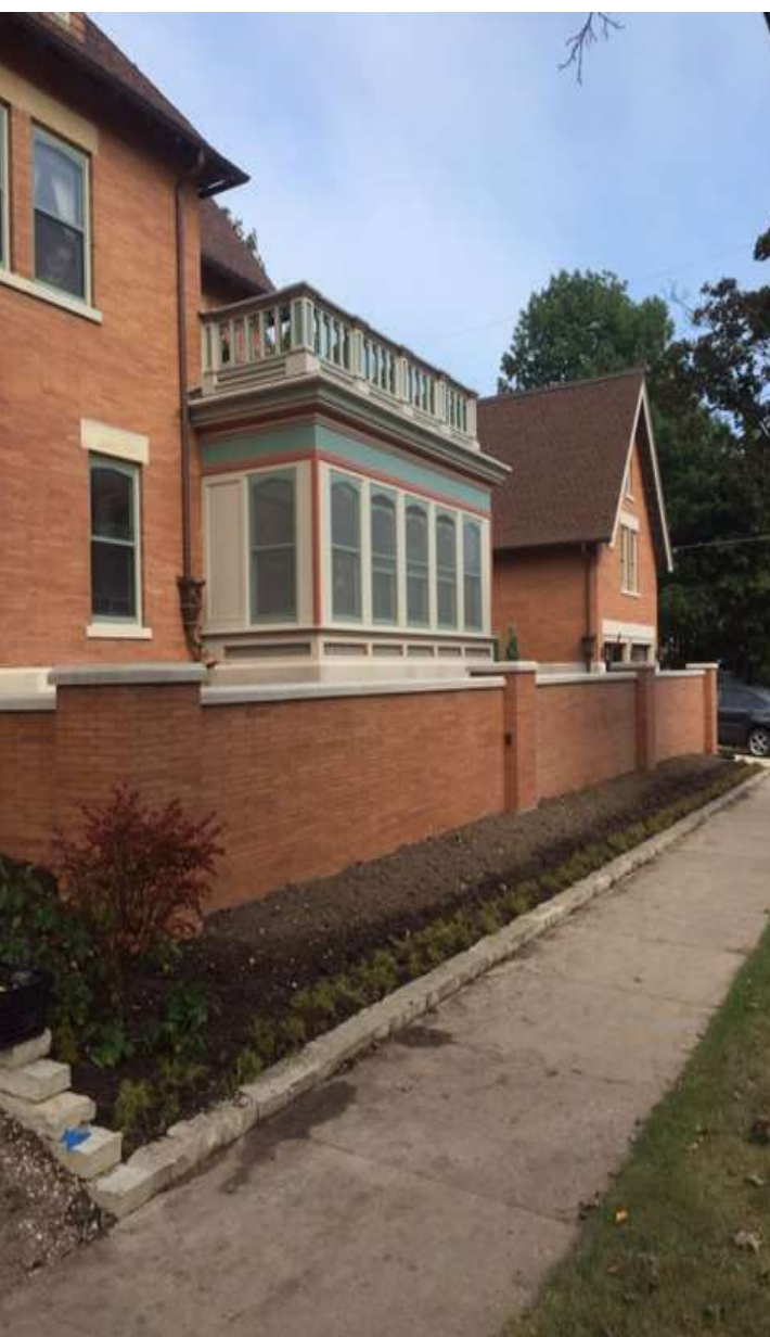
View of planting area between sidewalk and wall.