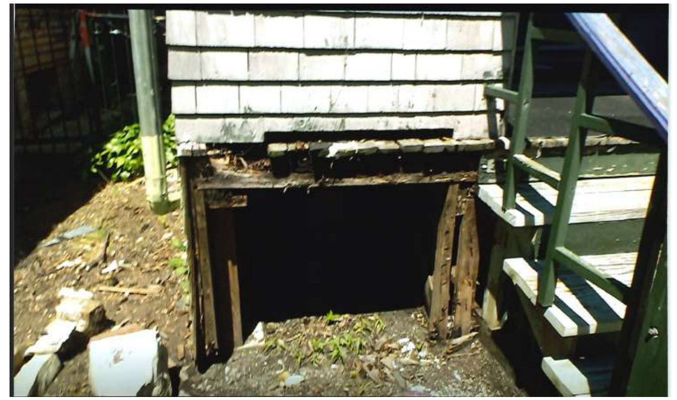
Porch section approved for repair.