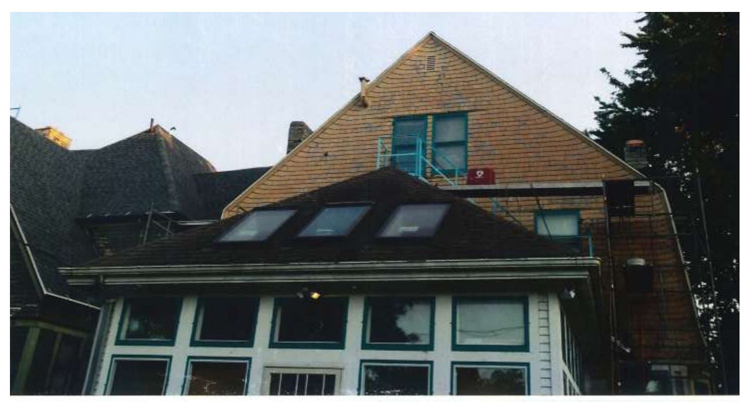
Rear view and new vent style.