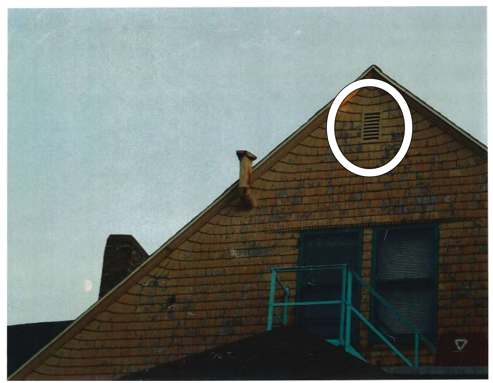
Replace louvered vent with above style vent.