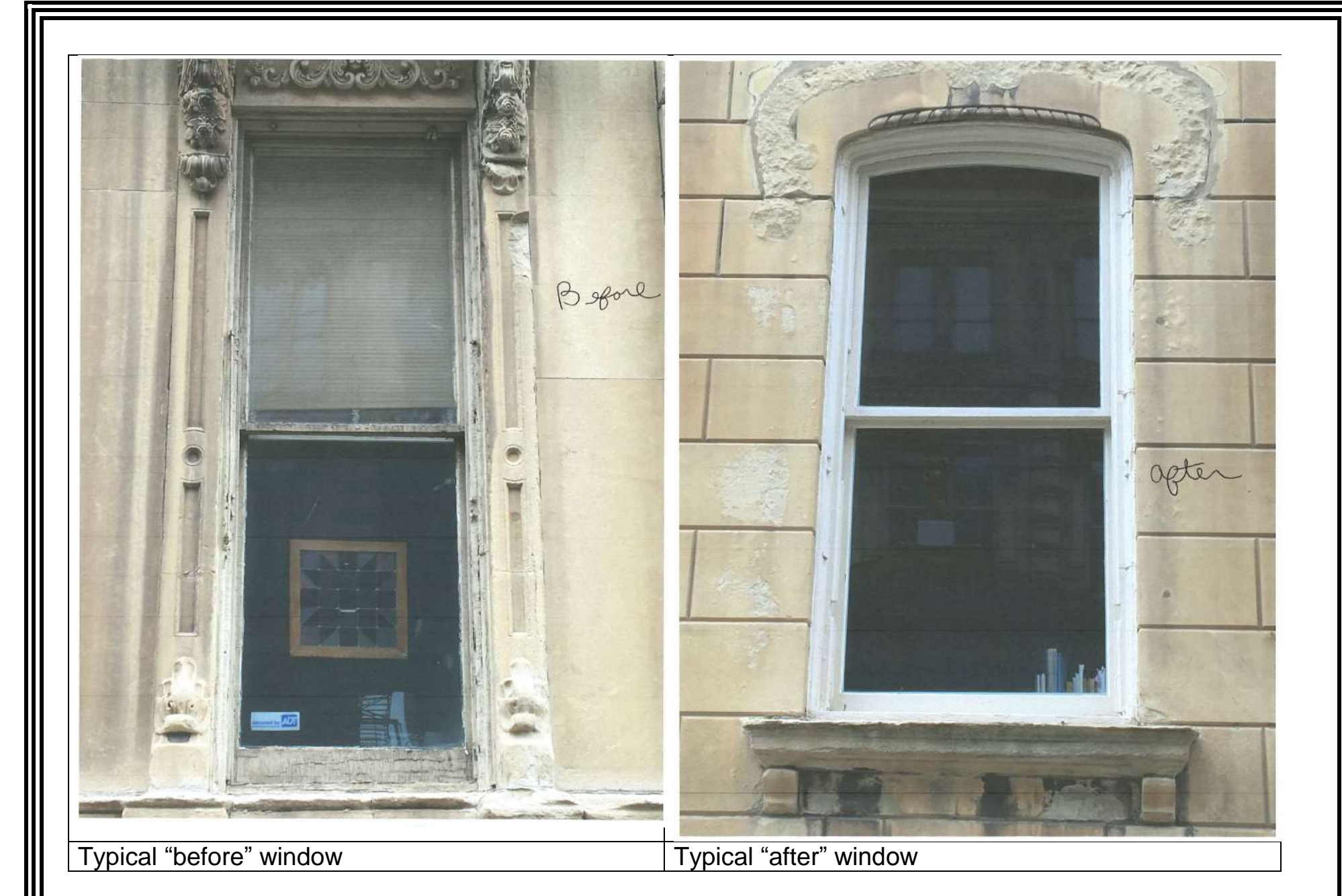
4 of 4